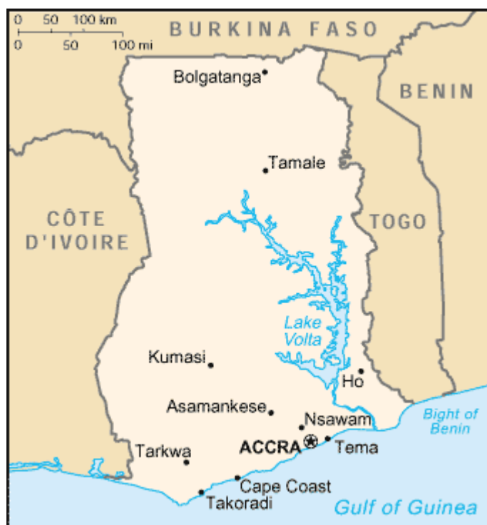
Figure 1. Map of Ghana

Atlantic coast. The map of Ghana below (Figure 1) shows all the nine of the ten regional capitals including Accra. Tema, which is also shown on the map is not a regional capital but is included because of its economic importance to the economy of Ghana. It holds Ghana's largest harbor and many manufacturing industries. The tenth regional capital, located in the northern most part of Ghana is missing from the map, as it is a fairly new regional capital.