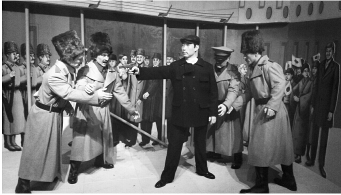
Figure 2. Selective Display of Ahn Jung-geun at Namsan Memorial Hall