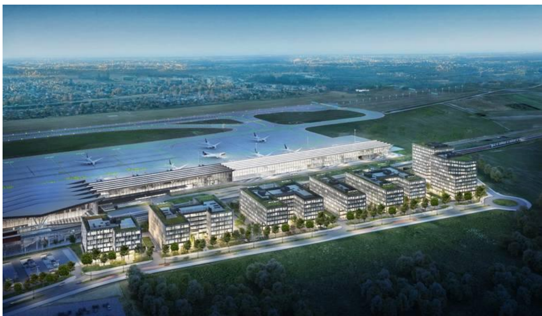
Figure 3. Visualization of the airport city at Gdańsk Lech Wałęsa Airport.

facility. Ultimately, seven buildings are going to be built, depending on the demand reported by the market and potential lessees (Gdańsk Airport, 2019). A visualization of the development of the space around Gdańsk Airport is presented below (Figure 3).