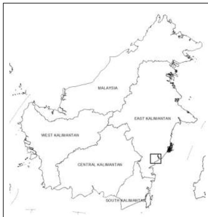
Figure 1 Site location.

The AirSAR fully polarimetric data consist of three frequencies, i.e. C- ( 5.3 GHz), L- ( 1.2 GHz) and P-band ( 0.45 GHz). However, in this experiment, only C-band fully polarimetric dataset was utilized to assess coastal land cover. The data were pre-processed in 30 April 2001 by the Jet Propulsion Laboratory/NASA.