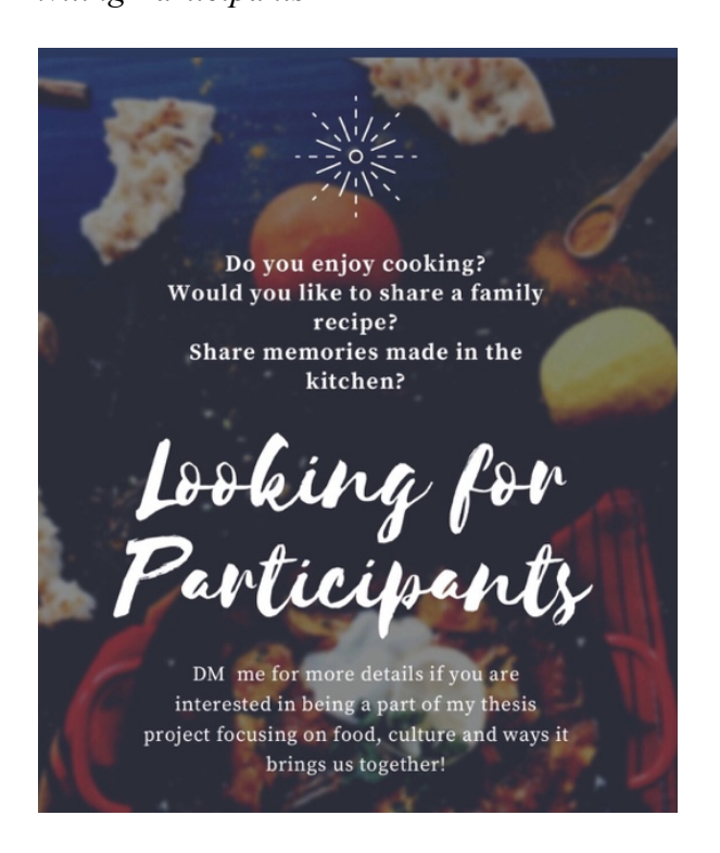
Figure 1 Flyer Inviting Participants

Note . This is an image of a flyer that I created that includes relevant information about the study to invite participants.