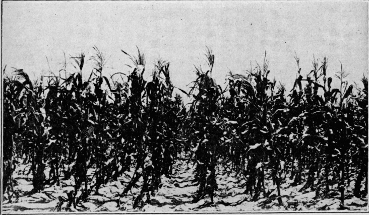
Figure 2.—Spacing of rows three feet apart, with individual stalks 36 inches apart in the row. This distribution carries 4840 stalks to the acre.

stalks in the row, or six feet wide with eighteen inches between the stalks in the row. The further precaution of using guard rows, both at the ends and at the sides of plats, was taken to obtain conditions comparable and applicable in the field under the systems of planting used.