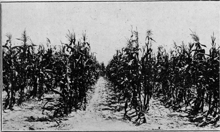
Figure 3.—Spacing of rows six feet apart, with individual stalks 18 inches apart in the row. This distribution carries 4840 stalks to the acre.