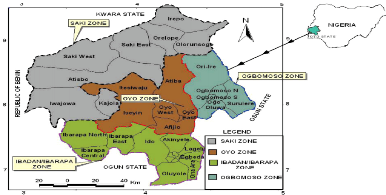
Figure 1 Map showing the Four ADP zones in Oyo State, Nigeria