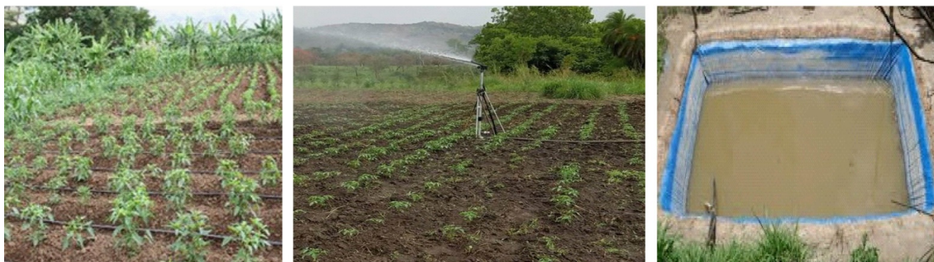
a. Drip irrigation system set up in tomato demonstration garden b. Sprinkler irrigation system in a tomato garden c. Underground tank lined with tarpaulin