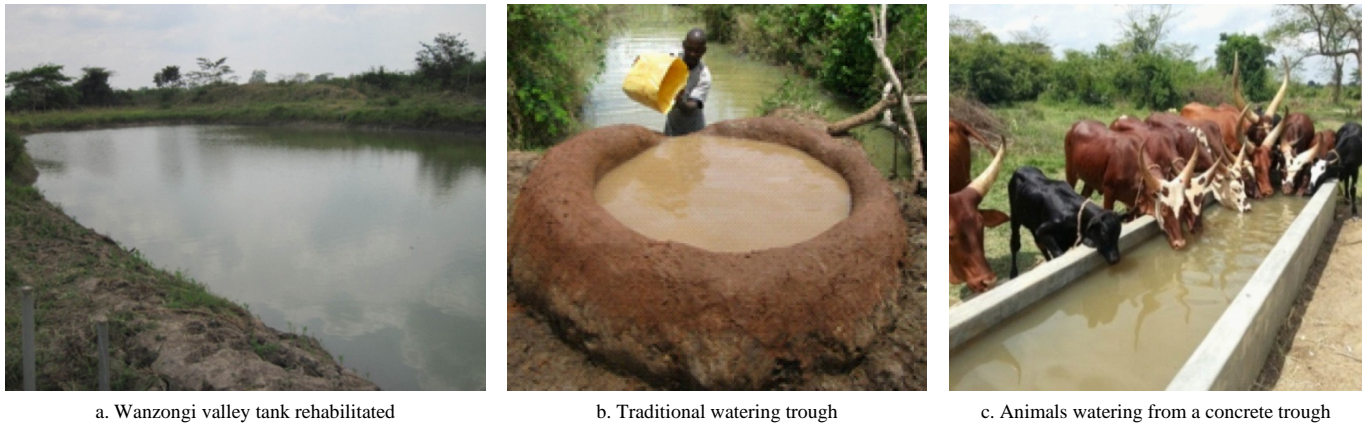
Figure 6 RWH system for livestock production

which abstract water from the nearby valley tank (Figure 6c). Other traditional ways of collecting water from the valley tank, use of opened jerry cans is still practiced. Water is poured in a small watering trough built with earth material from anthills at which animals converge to drink water (Figure 6b).