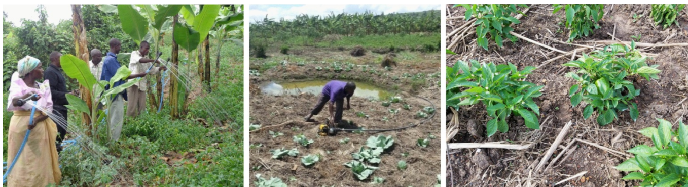
a. Locally made sprinklers used to irrigate tomatoes b. Petrol pump used c. Irrigated green pepper

In Hoima district, the RWH system used is the excavated underground tank lined with tarpaulin (Figure 5c) and drip and sprinkler irrigation systems (Figure 5a and 5b) which are relatively cheap since their costs are within the income range of most smallholder vegetable farmers. The mode of operation of the drip irrigation system is that water is abstracted from the underground tank using a motorized pump and discharged into an overhead tank and water is let to move through the laid laterals within demonstration gardens under a pressure created by the pressure head. For the sprinkler irrigation system, the discharge pipe is connected to the sprinkler and water is pumped from the underground tank under pressure, thereafter water is sprayed around the garden (Figure 5b).