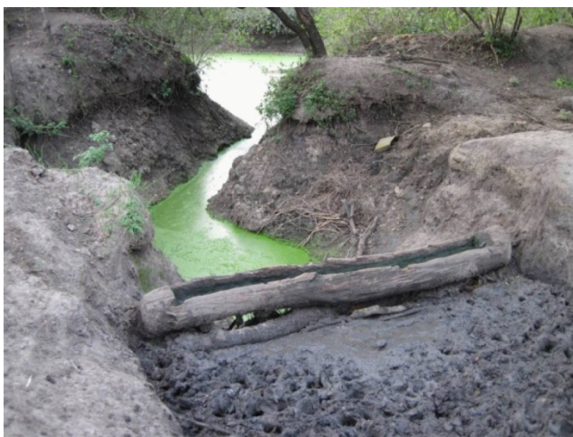
a. Valley tank with contaminated water in Kalungi subcounty