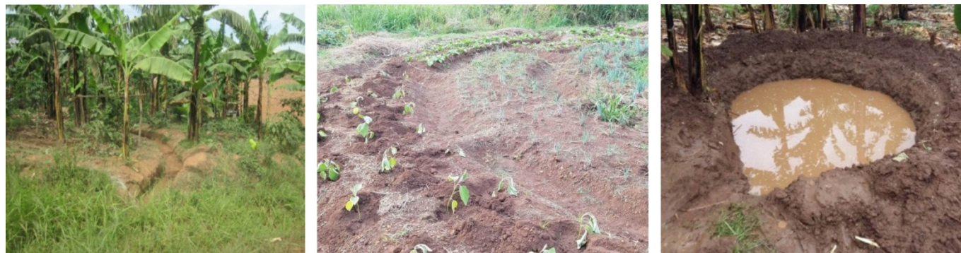
a. Fanya juu contour bund in a banana plantation

regions which led to enhanced yields in both crops and animals. Households that had adopted the innovations were food self-sufficient and they had surplus food, which was sold to generate income (Ngigi, 2003b). These technologies have made significant impact in reducing soil erosion in semi-arid areas with relatively steep slopes (Ngigi, 2003a).