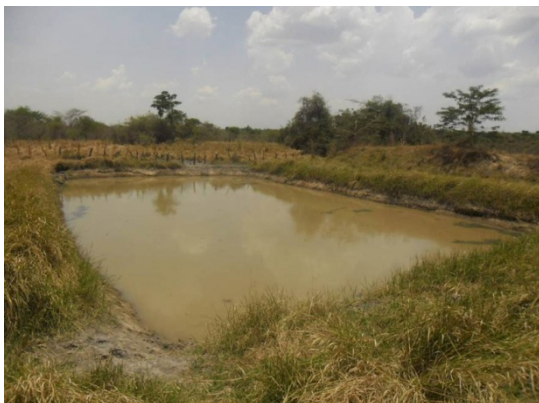
a. Farm pond

which comprised a 4 m 3 ferro cement tank built on the embankment. This tank is filled using a fixed semi-rotary pump. The water flowed by gravity to the watering trough is shown in Figure 3b. MWE (2012) reported that 53 valley tanks were constructed in the Financial Year of 2010/11 with capacities ranging from 6000 to 10,000 m 3 at parish levels in the districts of Luwero (9 tanks), Nakasongola (8 tanks), Kyenjojo (1 tank), Rakai (9 tanks), Masindi (8 tanks) and Sembabule district (9 tanks). It has been reported that these valley tanks have greatly improved the water storage for livestock in those respective areas. The Government has also rehabilitated dams as means of increasing water capacities in dry areas. Likewise, new dams and tanks have been constructed to increase water storage for agricultural and multipurpose in many districts of Uganda. There are cases in Karamoja where dams can only hold water for a period of less than three months because of their small capacities. Because of this, the communities are suggesting that the Government should consider constructing bigger dams especially in Napak and Moroto in order to solve the water crisis.