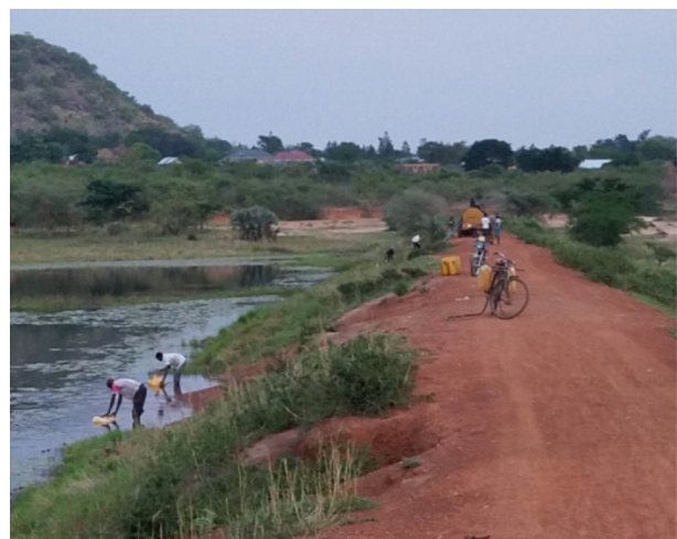
b. Valley dam near Nakasongola town where pastoralists migrate to water animals in prolonged dry spells