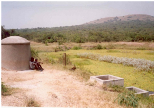
b. Valley tank with a ferro-cement tank for domestic water supply and a series of trough for livestock water delivery.