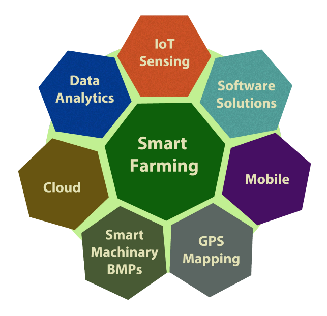
Figure 1 Elements of smart farming

Digital technologies are changing or even disrupting businesses everywhere by revolutionizing the role ICT plays in our everyday lives. Gartner (2012) and the IEEE Computer Society (2015) have presented their predictions for the top technology trends for 2016. Innovations in smart devices are driving radical changes in business practices. Additionally, the "Nexus of Forces" - the convergence and mutual reinforcement of mobility, social media, cloud, and information (big data) (Gartner, 2012) - drives new business scenarios and continues to evolve as it combines with the IoT. "Cloud first, mobile first" have become widely accepted IT strategies for businesses. While mobile apps have provided unprecedented solutions at users' fingertips, the cloud offers a promising infrastructure for integration of data, services, and applications. It becomes an enabler for unified solutions to aggregate various pieces of new and existing solutions in a cloud environment.