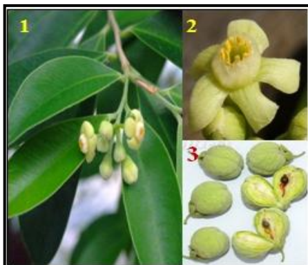
Figure 1 Aquilaria malaccensis . 1. leaf, 2. flower, 3. Fruit

Aquilaria malaccensis is a large, evergreen tree, up to 20 - 40 m tall (Adelina, 2004) and 1.5-2.5 m wide, with a moderately straight and often fluted stem bearing thin, pointed leaves, 5-8 cm long and with several parallel veins (Chakrabarty et al. , 1994). Flowers are hermaphroditic, up to 5 mm long, fragrant and yellowish green or white which blooms at June. Fruits which appear in August, are green, egg-shaped