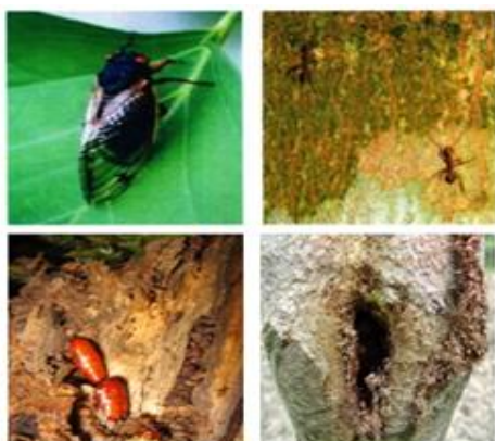
Figure 3 Natural inocular.

In natural forest, only about 7% of the trees are infected naturally (Ng et al. , 1997). Formation of agar wood can be initiated by natural injuries (by ant, snails or fungus) and mostly obtained at the junctures of broken branches (Gauthier et al. , 2015).