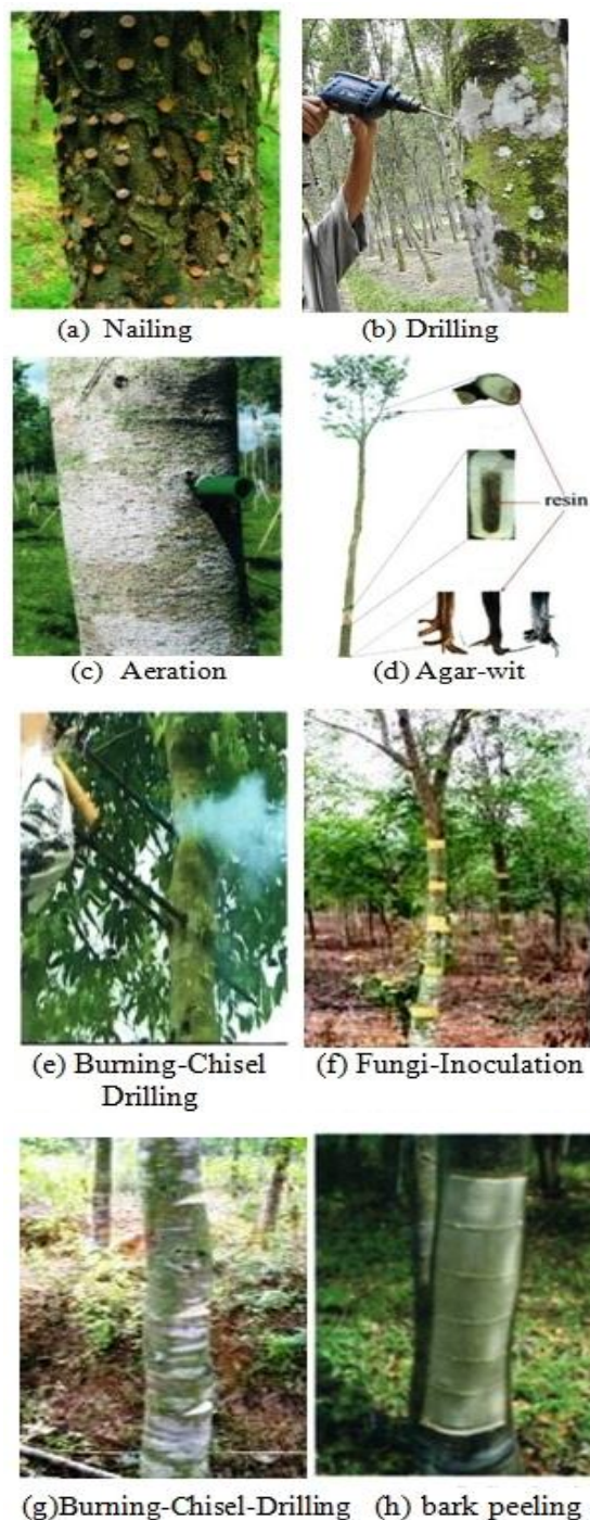
Figure 4 (a) Nailing method, (b) Drilling method, (c) Aeration method, (d) Agar-wit method, (e) Burning-Chisel-Drilling method, (f) Fungi-Inoculation method, (g) Partly-Trunk-Pruning method, (h) bark peeling off (Source: Liu et al. , 2013).

(b) Drilling method: A drill is usually employed to make holes in the trunks and main branches of mature trees (Akter et al. , 2013). The drilled pores were placed in a spiral fashion on the tree from the ground line up into the crown. Wounds were placed 3 to 5 cm apart and inoculated with resinous agarwood powder or kept open to ease access of natural agents into the pores. Pores are checked and rewounded every 2-3 months (Blanchette, 2006).