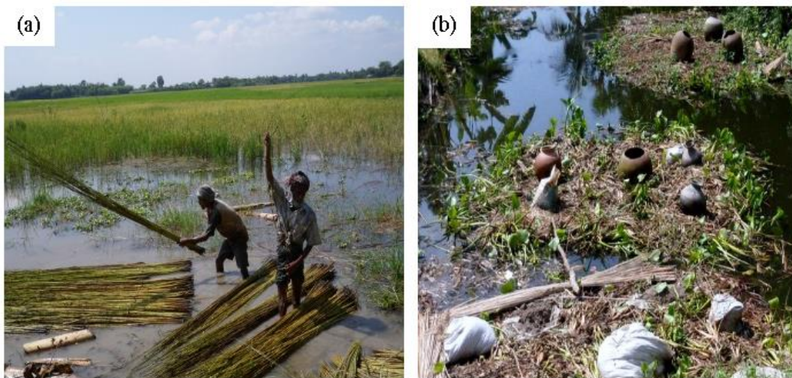
Figure 2 (a) Stem retting in the rice field and (b) Stem retting in the small canal with dirty water

minimum ratio of plant material to water in stagnant water should be 1:20 (IISG, 2009). In this process, bundles are kept under water in 2-3 layers. In about 15-20 days, the retting is completed and then fibers are extracted manually, washed and dried for sale (Islam and Rahman, 2013). The traditional retting has been used for a long time to pull out of fibers from jute.