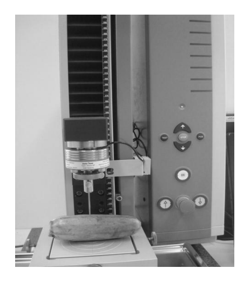
Figure 2 Specific device for measured penetration force

A typical force-deformation curve for compressed sample is shown in Figure 3. Some mechanical properties determined from force-deformation curves and other properties were calculated. Penetration force was determined by specific device, as is shown in Figure 2. In this test, the special needle with 5 mm per minute speed as 5 mm into the samples and determined the penetration force.