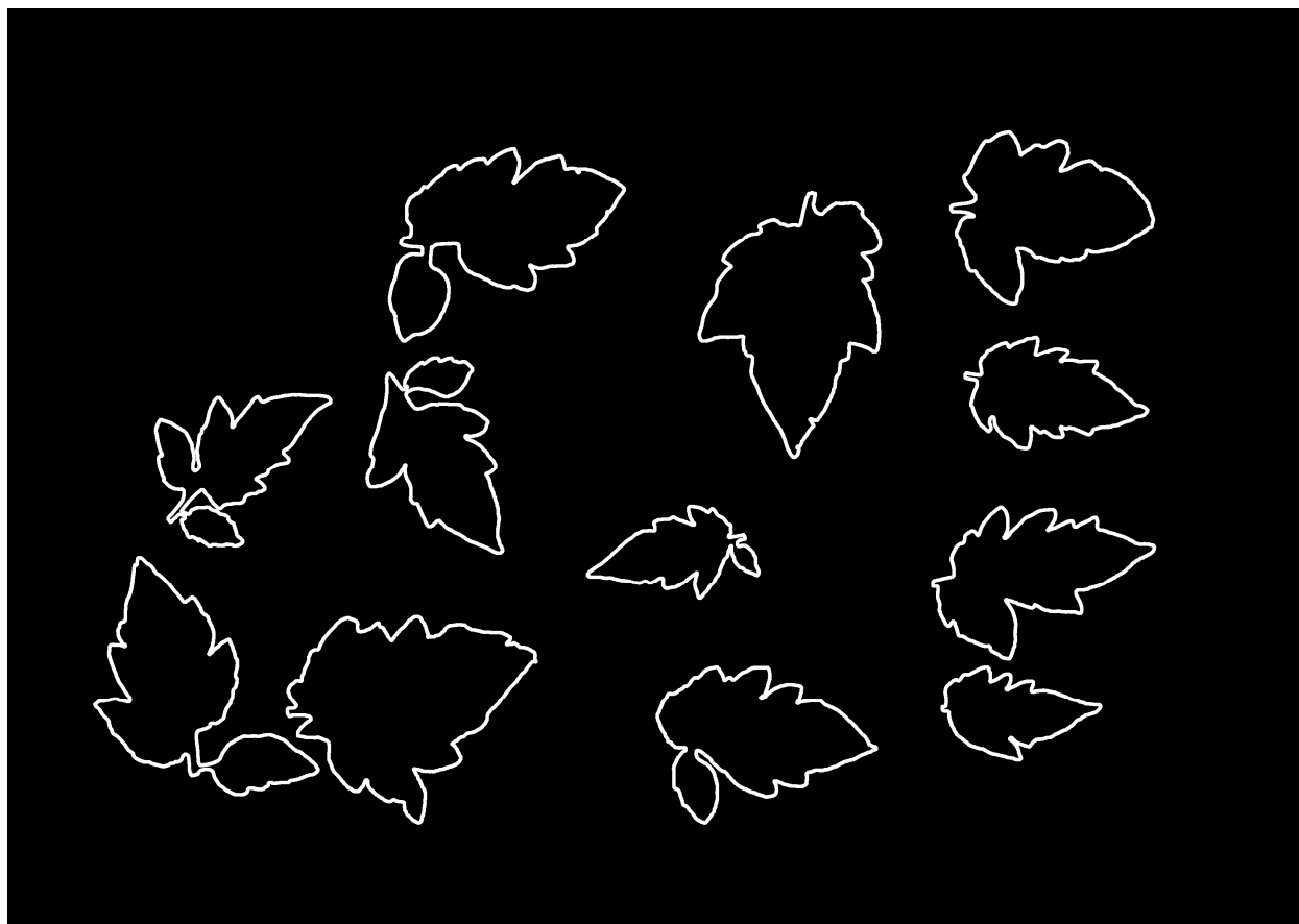
Figure 2. Example of an image where tomato leaf outlines were extracted after the digital image processing procedure.

On the obtained images a total number of 400 points (x, y) equally spaced on the perimeter, describing the outline of the leaves, were acquired utilizing EFA (Fig. 2).