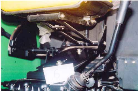
Figure 2. Tractor seat view showing suspension mechanism and inclined seat base plate

Five commonly adapted tractor seats (S1, S2, S3, S4 and S5), as shown in Fig. 5, of different makes were procured for precise measurement with the instrument installed. The Seat Reference Point (SRP) and Seat Index Point (SIP) (SRP & SIP were determined as per the IS 11806, 1986 and IS 11113, 1985, respectively standards) were located by SRP device, as shown in Fig. 6. Various angular measurements, shape, seat mounting base area etc. were also worked out.