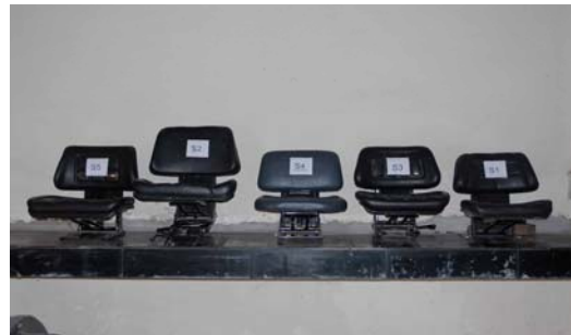
Figure 5. Selected tractors seats for laboratory study