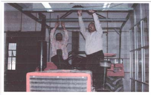
Figure 4. Setting up triangle detector array of freepoint-3D digitizer measurement set-up