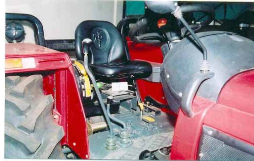
Figure 3. Overall view of a tractor seat without open space for backrest