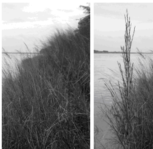
Fig. 3. Vetiver grass leaves (left,) and flower (right)

Vetiver grass leaves are somewhat like those of sugarcane, but narrower (Fig. 3). Although the blades are soft at the top, the lower portions are firm and hard. On some vetiver types the leaves have sharp edges. Actually this is due to tiny barbs. There is a lot of variability, however, some plants are fiercely barbed, some are not. The ones used for oil and erosion control tend to have smooth edges. Topping the plants is an easy way (at least temporarily) to remove the bother of the barbs. The leaves apparently have fewer stomata than one would expect, which perhaps helps account for the plant withstanding drought so well. The stems provide the "backbone" of the erosion-control barrier. Being strong, hard, and lignified (as in bamboo), they act like a wooden palisade across the hill slope or plain land. The strongest are those that bear the inflorescence. These stiff and cane like culms have prominent nodes that can form roots, which is one of the ways the plant uses to emerge out of the soil when it gets buried. It also moves up by growing from rhizomes on the crown.