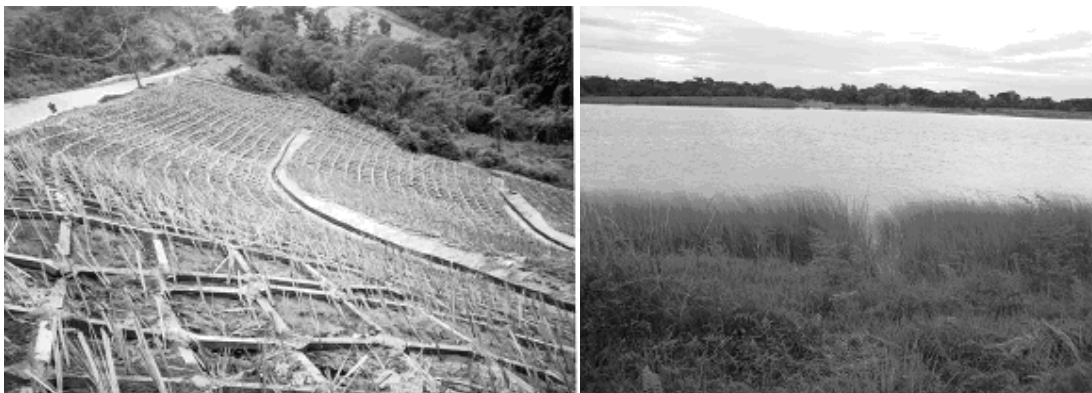
Fig. 6a. Vetiver grass used to protect the hilly road from mud slide in Thailand (PRVN, 2004) and Vetiver grass used to protect river embankment from soil erosion in Bangladesh (right)

The farmers and foresters may use vetiver not only for soil conservation, but for the increased yields fostered by the moisture held back by the vetiver hedges. The by-products of vetiver can also be used for fire control, forage, mulch, thatch, and so on (NRC, 1993).