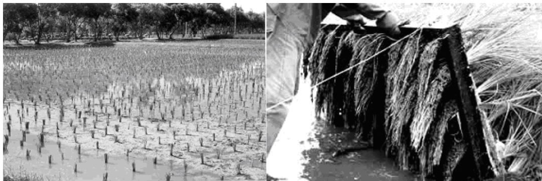
Fig. 7. Vetiver grass used for the biological treatment of the soil and wastewater (PRVN, 2004)