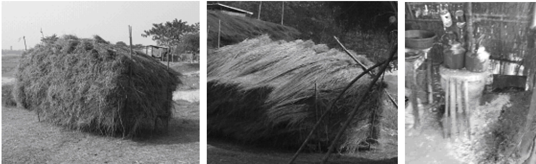
Fig. 8. Dried vetiver leaves (left & middle) & dried leaves are using for preparing tea in a rural tea shop (right)

Broken vetiver culms and leaves that cannot be utilized for other purposes can be mixed with water hyacinth, as a mixer, in a proportion of 3:2. Then compress the mixture into shafts with a cylinder-shaped fuel squeezer, 1.7 cm in diameter. Fuel shafts can burn easily and produce little smoke, but yield high heat. For example, it takes 5 min. to boil 1 litre of water, and the fuel still keeps on burning for up to 28 min (Babpraserth et al., 1996). Dried vetiver leaves are widely used in rural areas of Bangladesh for cooking purpose which is shown in Fig. 8.