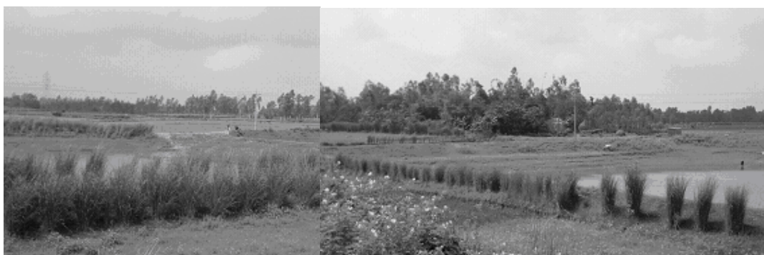
Fig. 6b. Vetiver grass is growing across the roadside of Bangladesh