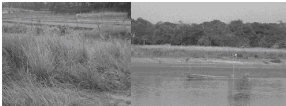
Fig. 2. Vetiver grasses grow in Barind tract (left) and riversides (right) of Bangladesh

Vetiver grass is able to act as a natural barrier against erosion as well as pollution. It produces massive odorous root system which can be used for the extraction of an essential oil of great economic importance. This grass is being used in China, Australia, Vietnam, Thailand, Philippine and Bangladesh (Fig. 2), for river bank and dyke/stream bank stabilization, mitigation of soil and water pollution. Generally, in Bangladesh this grass, commonly known as ‘Kash’ is widely used as a low cost rural house construction material and biomass fuel, which results in depletion from its original habitats. Due to rapid growth of industrialization, heavy metals from the industrial, agricultural and domestic effluents being added to our soils, persist in soils and can be absorbed in soil particles or leached into ground water. Human exposure to these metals through ingestion of contaminated food or uptake of drinking water can lead to their accumulation in humans, plants and animals.