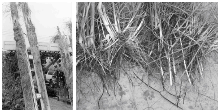
Fig. 4. Vetiver grass roots (PRVN, 2004) and right at BAU (Bangladesh)

Perhaps most basic to this plant's erosion-fighting ability is its huge spongy mass of roots. These are not only numerous, strong, and fibrous, they tap into soil moisture far below the reach of most crops. They have been measured at depths below 3 m and can keep the plant alive long after most surrounding vegetation has succumbed to drought which is shown in Fig.4.