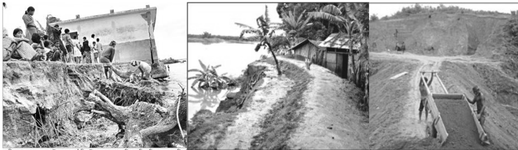
Fig. 1. Present situation of soil erosion in Bangladesh

or sediment retention ponds are not properly employed. In Bangladesh, no such measures are practiced at the construction sites (Khalequzzaman 2007).