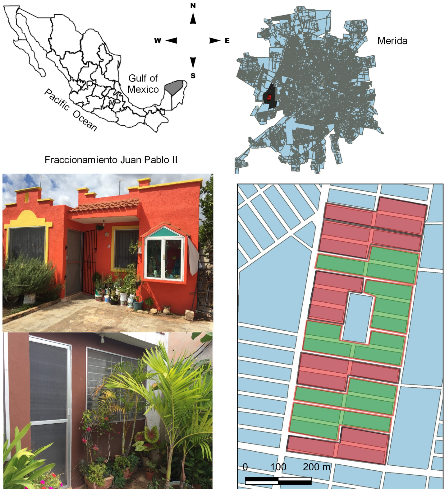
Fraccionamiento Juan Pablo II