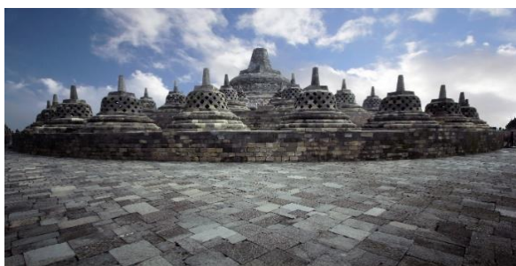
Figure 1 Borobudur temple

The existence of MSME is expected to be sustainable developed by exploring the existing potential. Magelang Regency has various types of developing MSMEs including food processing industry, tofu industry, batik industry, handicraft industry, furniture industry and various other types of industry (Syaifuddin & Purwohandoyo, 2019). It is hoped that in the future the populist economy will be able to be developed, strengthened and be cultured with various activities that provide useful value both in terms of quantity and quality to the growth of MSMEs as well as to increase the number of tourist visits to Magelang Regency.