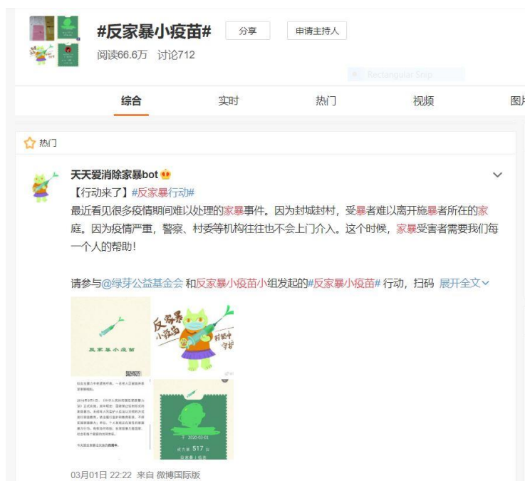
Figure 2. ‘Anti-Domestic Violence Little Vaccine’ social media account

To raise public awareness of the issue, Guo organised an online workshop. In the workshop, feminist activist Feng Yuan shared her experience of and gave the audience advice on how to deal with domestic violence. The live broadcast and its recording attracted 1,200 viewings on that day, with positive feedback from participants and viewers (Guo 29 February 2020).