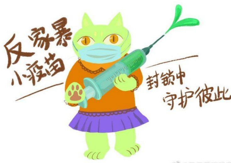
Figure 4. ‘Anti-Domestic Violence Little Vaccine’ campaign logo