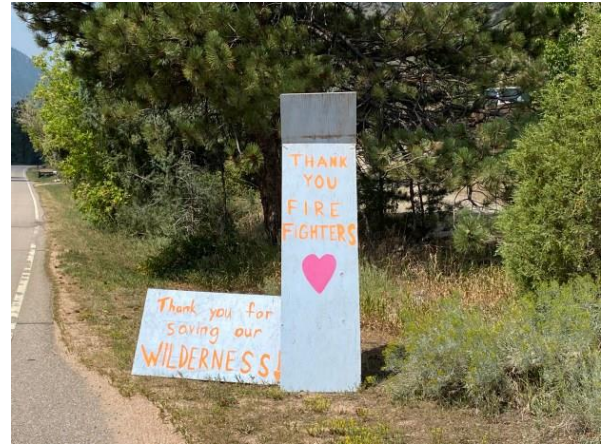
Sign in the Poudre Canyon

I attempted to count each plywood sign that I passed that proclaimed gratitude for the wildland firefighters that worked up there for weeks, though I soon lost count. Each mailbox in the canyon has similar signs nailed to their posts. Some are written in child's handwriting—"Thank You Firefighters." The paint is often worn away by snow and weather, but the message remains distinct. Some of the signs are years old, relics from the High Park fire of 2013, and some are new this fall.