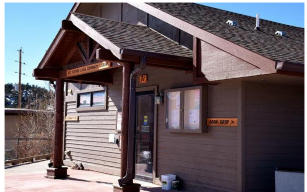
Red Feather Lakes Community Library

Days of my childhood were spent weaving in and out of the stacks at that library, checking out the same books over and over again. Although the library is a small, wooden building, resembling more of a barn than a municipal building, it took on the form of a castle in my childhood. Virginia Woolf once inscribed in her diary, "I ransack public libraries and find them full of sunken treasure" (Woolf). Certainly this was true in that small wooden library. There, at 71 Firehouse Lane, I found treasure in the dusty rejects, the donated and over loved books.