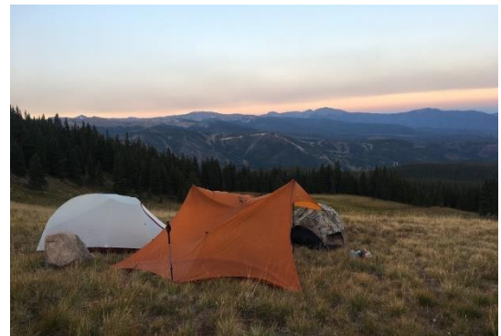
Backpacking in the James Peak Wilderness, amidst wildfire haze

For weeks this fall, I awoke to find layers of ash on the concrete outside my dorm in Denver, originating from the Cameron Peak fire miles and miles away. The smoke clouded our skies and painted our sunsets a disturbing and uneasy red. Over Labor Day weekend, I went backpacking in the James Peak Wilderness above Winter Park, Colorado with my mom. We hiked high into the backcountry late one night, determined to reach a campsite above tree line. We set up our tents overlooking the Winter Park valley, the streetlights twinkling like stars.