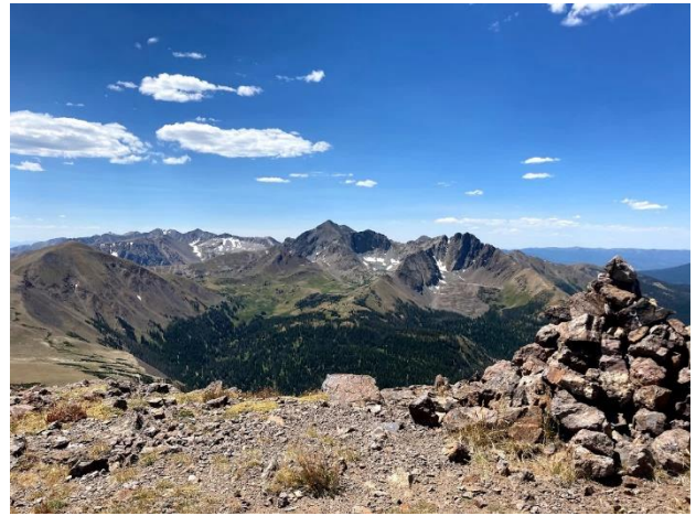
The Rawah Wilderness

The real world goes like this: At the top of each peak I climb, I will claim to be in the center of the world. The Never Summer and Rawah mountain ranges web out from my home, resembling the ridges of my knuckles, intersecting, separating, building the map of all I know. The map I memorize will tell me that there are jagged borders between my favorite valleys, but I know the path to take from one to another, ducking under branches and stepping over decomposing logs. I keep the tree line in sight; the alpine tundra calls like a home, always knowing which direction to point. The rise and fall of the sun carves a path in the rock. The Neota Wilderness, the Rawahs, the Never Summers become indistinguishable from each other. They were never meant to be separated, or claimed.