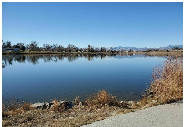
Berkeley Lake, Denver

He would likely find no value in my daily jogs to Berkeley Lake to watch the geese land on the surface of the muddied water. Yet in this my neighborhood near Regis, among the interstates and various lakes, I have found a place as salient, albeit different, as the one I have found in the Rawahs.