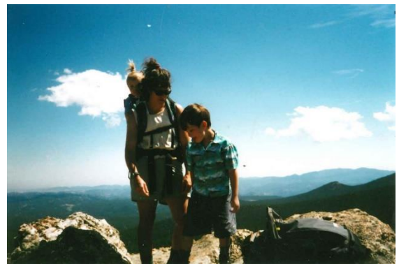
Hiking in the Poudre Canyon.