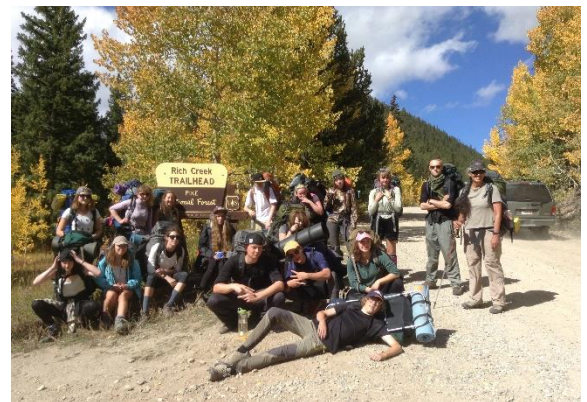
Backpacking in Buffalo Peaks in 2016

My education in the outdoors continued as I attended Polaris Expeditionary Learning School for middle and high school in Fort Collins, Colorado. Classes had an emphasis on civic engagement and community building through outdoor experiences. Several weeks each year were spent backpacking through the Buffalo Peaks