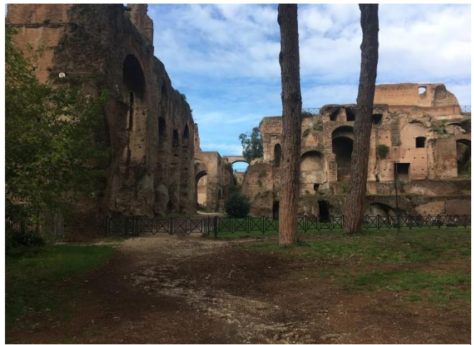
Exploring the ruins of the Pantheon in Rome.

In the fall of 2019, as the air grew colder and the leaves fell from the trees, I found myself walking amidst these ruins, exploring the Seven Hills of Ancient Rome. The streets are now swarming with tourists and merchants trying to pawn off plastic keepsakes, but they were at one point holy places dedicated to each god. I spent hours each day weaving in and out of the crumbling remnants of their holy structures, trying to reconcile the centuries of history that once buried these structures that are now exposed to such a globalized public. The Roman streets now are home to ancient churches and shopping malls in the same block. I only visited Rome for a few days during the months I spent in Italy and I do not pretend that this constitutes any amount of a comprehensive understanding of Roman culture. Yet, like any traveler, I tell people of the visceral feeling I experienced in Italy and the genius loci I came to know while traversing the city on foot.