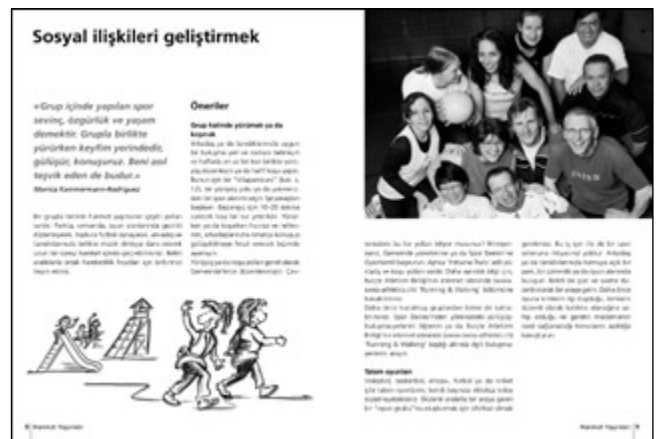
Figure 2: Content of the Turkish version of the brochure. The two pages deal with the social benefits of physical activity

pictures show a great diversity: there's family activities, activities with friends, team sports, dance, elderly people being active, etc. And also purely informative elements like walking or running trail signs are displayed."