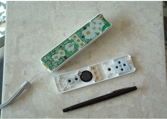
Figure 3 : The Wii controller, inside-out. Left: The famous accelerometer does not occupy a central location in the controller. Right: broken open we see a (4-layer) circuit board and some standard switches (buttons!).

These in-shoe systems are used now as orthotic calibration devices. They are used in medical applications for such things as diabetes screening, monitoring the results of surgery, fitting orthotic devices, and even for the analysis of athletic performance and for shoe design. An example of such a system is the F-Scan system<sup>1</sup>. This device has 960 sensors in a 60 x 21 grid, or