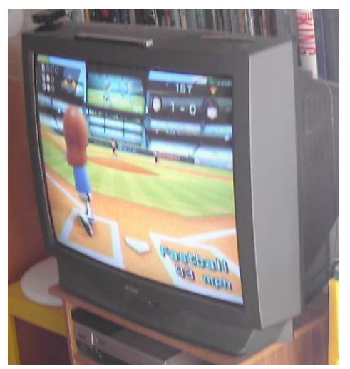
Figure 4 : Gameplay in the Wii Sports game. Left: The player is playing baseball. Although a smaller motion would work the same way, players tend to adopt a batting stance when playing. Left: The graphics are not high resolution or realistic, but they reflects the play and are 'fun'.