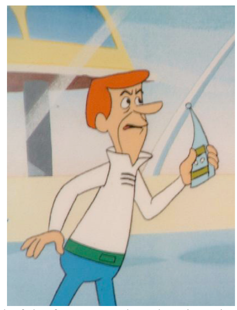
Figure 1 : Left: The labour-saving push-button world of the future seen by advertisers in the 1950's. Right: Cartoon character of the 1960's George Jetson had a 'futuristic' job as a 'digital index operator' (button-pusher).