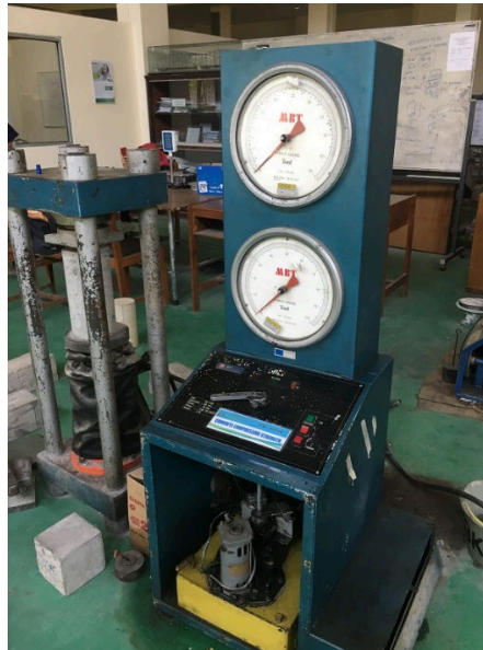
Fig. 3. Tensile and Compressive Test Machine

The tensile strength test is carried out by using tensile strength test machine as follows :