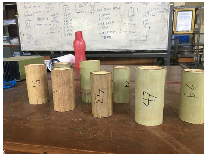
Fig. 2. Bamboo Samples