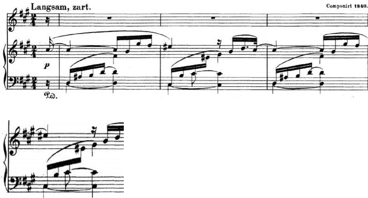
Figure 4-3. Schumann: “Im wunderschönen Monat Mai,” mm. 1-4