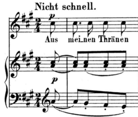
Figure 5-5. Schumann: “Aus meinen Tränen sprießen,” m. 1

The whole song is marked “Nicht schnell” (not fast) which represents the somewhat solemn mood, and a repetitive C# in the beginning of the vocal line indicates the stillness of the poet’s emotions (see Figure 5-5):