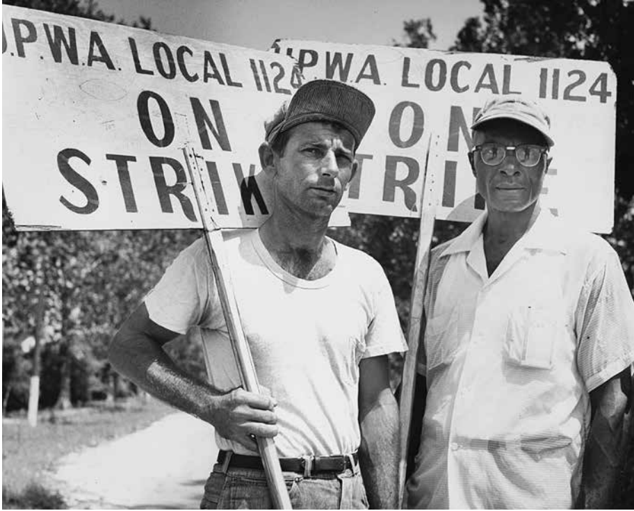
Figure 4. On strike against Godchaux Sugars in Reserve, Louisiana, 1955.

women also kept lookout for scabs and traveled across Louisiana to spread the “Don’t Buy” message. 39