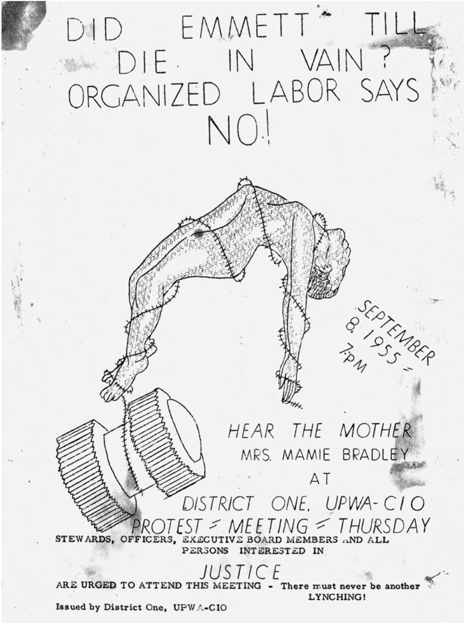
Figure 1. The United Packinghouse Workers of America (UPWA) was the first organization to sponsor a rally featuring Emmett Till's mother as a speaker. Over the next several weeks, Mamie Bradley spoke at dozens of rallies across the United States, sponsored by labor unions, churches, and the NAACP.