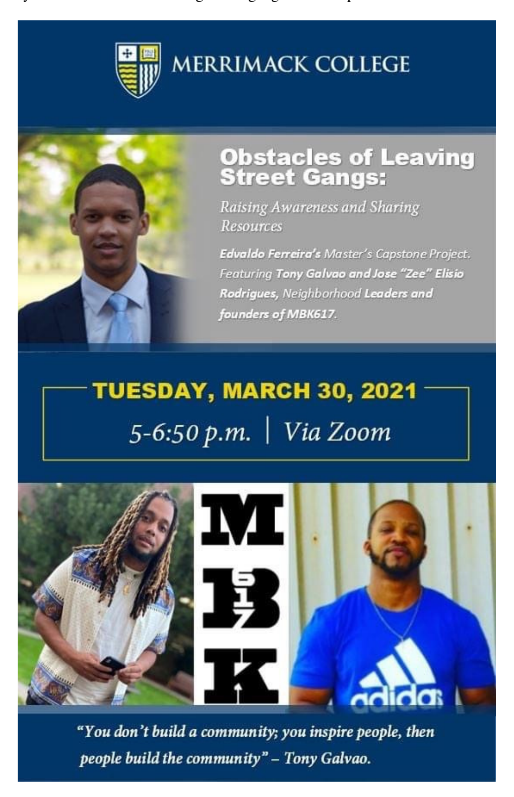
Figure 1. Flyer for Obstacles of Leaving Street gangs Workshop.