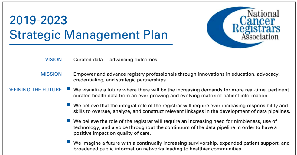
FIG 3. NCRA strategic management plan.

prepared to collaborate and generate high output and high-quality data to assist in the fight against cancer.