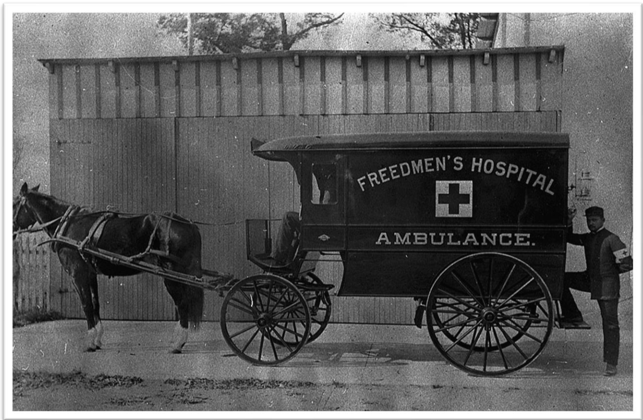
Ambulance for the Freedmen's Hospital