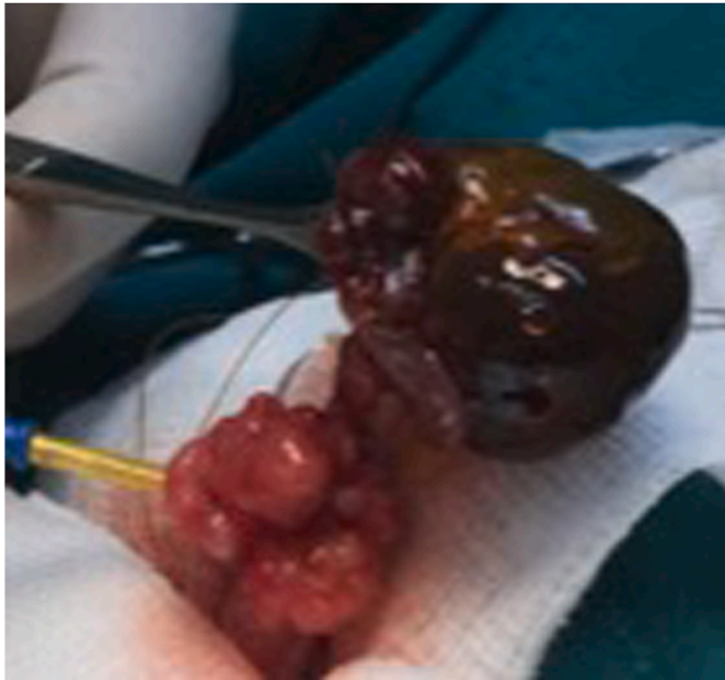
Fig. 3. Multiple mamelonade tumor observed during bladder opening.

urinary bladder with a favorable prognosis due to a 3-month follow-up without recurrences. A longer follow-up time is required to determine a true oncological response.