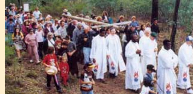
Pilgrimage to Lake Molyalup — Australia

"As Catholic young adults, joined to the mission of Christ in Baptism, we ask you to enrich our identity by providing us opportunities for meaningful catechesis, ongoing information and education ... Please invite us to honest dialogue that has potential for bringing us all to a deeper understanding of God's will." (Young Adult Delegates to 3rd Continental Congress on Vocations)