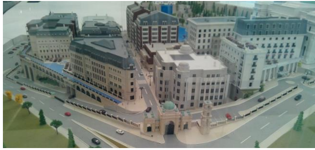
Figure 2. Campus of Ankara Music and Fine Arts University

Entrance gates inspired by classical Greek and Roman porticoes containing elements such as columns, capitals, architraves, friezes, cornices, and triangular pediments, are used in the buildings. Columns that are not load-bearing or are made of Reinforced concrete are an obvious example of formalism (Figure 3).