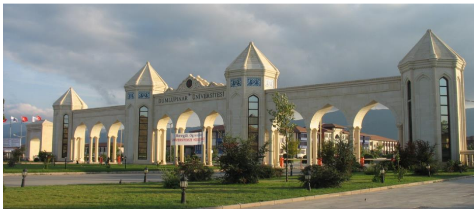
Figure 16. Entrance gate of Kütahya Dumlupınar University