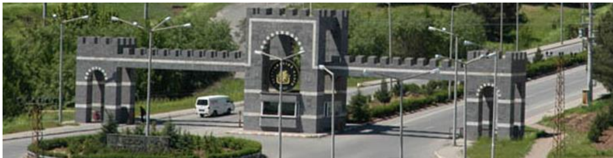
Figure 19. Entrance gate of Dicle University