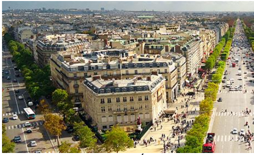
Figure 1. Champs-Élysées Street