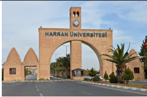
Figure 18. Entrance gate of Harran University