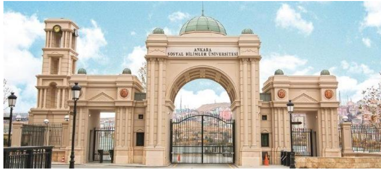
Figure 14 Entrance gate of Ankara Music and Fine Arts University