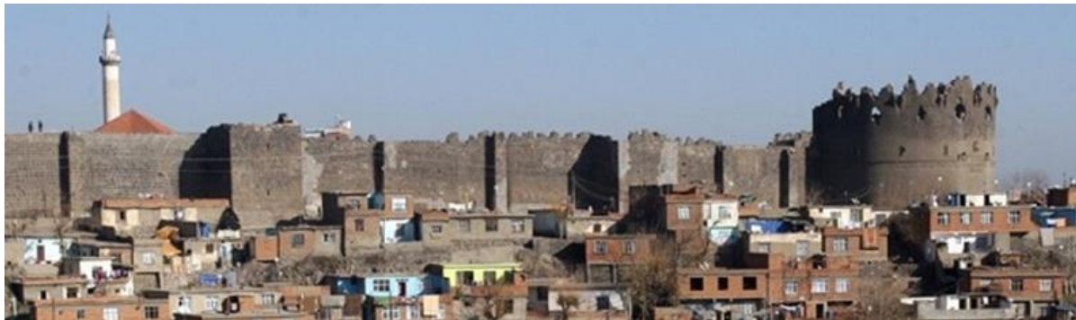
Figure 20. Diyarbakir City Walls