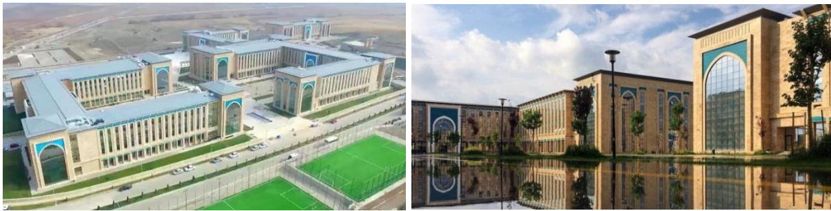
Figure 9. Buildings of Ankara Yıldırım Beyazıt University Faculty of Political Sciences

The construction of the Faculty of Political Sciences of Ankara Yıldırım Beyazıt University, which was established on 21 July 2010, was completed in 2016 in Çubuk. Pointed arches with the tile coverings, moldings, low reliefs on them, the corner towers which differed from the facade and designed as high and protruding refer to the First Turkish National architectural style. The portals at the building’s entrance emulate Seljuk and Ottoman architecture. However, the exaggerated proportions and the modern materials used reveal a ‘kitsch’ and ‘facadist approach’ (Figure 9).