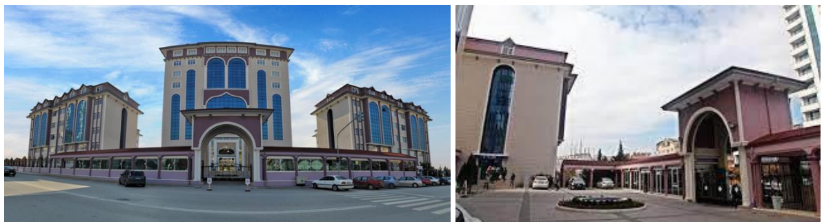
Figure 10. Buildings with arches, buttresses, and eaves and portals at Ankara Yıldırım Beyazıt University

In Etlik campus named as National Will Building of Ankara Yıldırım Beyazıt University (Figures 10), there are Rectorate, School of Foreign Languages, Faculty of Health Sciences, Sports Sciences. In this building, round arches, Bursa arches used together with modern forms and at the entrance gate the buttresses under the moldings, wide eaves referring to historical forms, sub-eaves buttresses, columns have referenced to second National Architectural period.