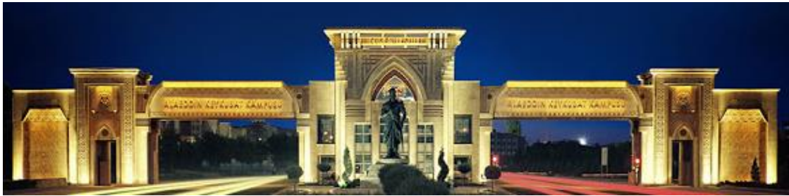
Figure 15. Entrance gate of Selcuk University