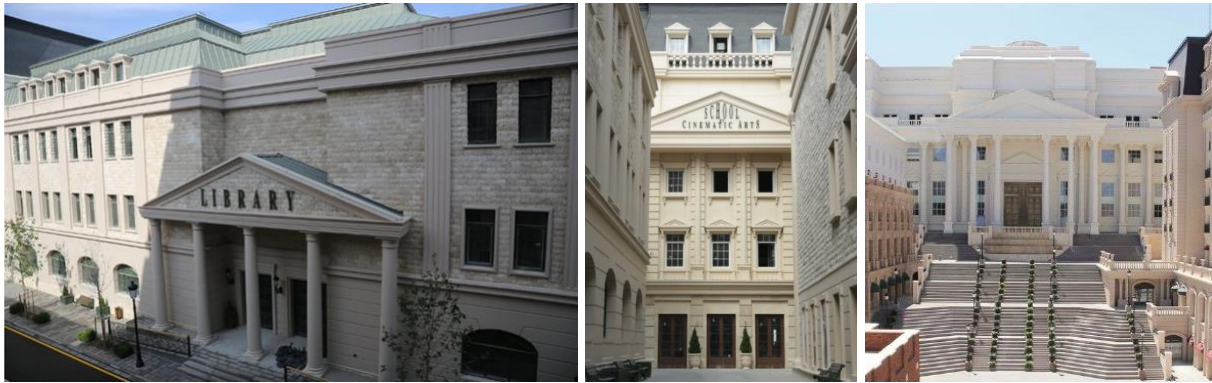
Figure 3. Entrance gates inspired by the classical Greek and Roman porticoes at the Ankara Music and Fine Arts University

Entrance gates inspired by classical Greek and Roman porticoes containing elements such as columns, capitals, architraves, friezes, cornices, and triangular pediments, are used in the buildings. Columns that are not load-bearing or are made of Reinforced concrete are an obvious example of formalism (Figure 3).