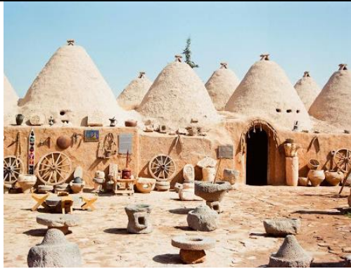
Figure 17. Traditional Harran houses