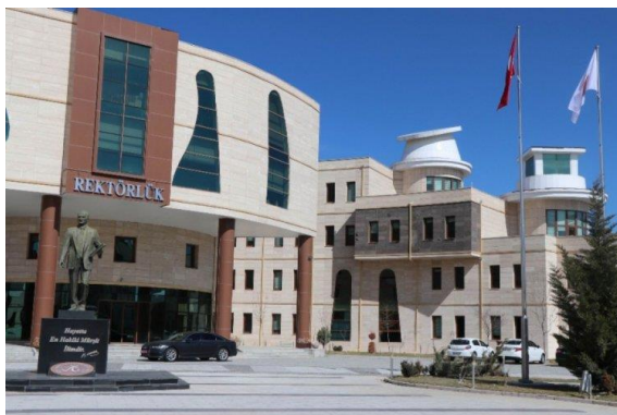
Figure 12. Hacı Bektaş University buildings details