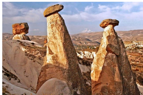
Figure 13. Hoodoos (fairy chimneys) in Nevşehir

In recent years, elements imitating the Seljuk portals, which are stylized in an orientalist way, have been used predominantly in most universities. Proportions they are gathered from historical form have been used by distorting in these structures that are constructed as high-rise thanks to the modern materials and facilities provided by modern technology. Postmodern ‘orientalist’, ‘neoclassical’, ‘eclectic’ and ‘kitsch’ styles can be found at university campus gates also. There are campus gates that use forms derived from local architectural symbols, or a famous historical building of the city where it is located and refers to the classical Greek, Roman, Renaissance, Neoclassical, Seljuk, Ottoman, Turkish national architectural styles and the concept of ‘Turkish house’. As some examples of these (Table 1), Ankara Music and Fine Arts University campus gate (Figure 14), which uses forms from Classical Greek, Roman, and Renaissance architecture such as column, capital,