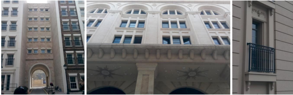
Figure 4. Facades and details inspired by Venetian, French and Roman architecture at the campus of Ankara Music and Fine Arts University