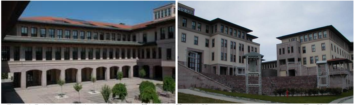
Figure 8. Buildings with windows inspired by Traditional Turkish House, oriels, eaves, buttresses, at Koç University Rumelifeneri Campus