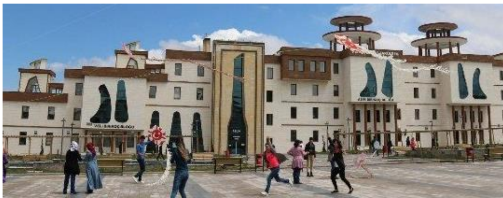
Figure 11. Facades of Hacı Bektaş University Buildings

Historicist forms that differ from the structures and are emulated with exaggerated proportions; designings of the openings inspired by the form of hoodoos locally known as ‘fairy chimneys’ that are parts of Nevşehir's urban identity, or kitsch architectural elements on the roof referring to the caps of hoodoos creates their own hyperreality (Figure 13).