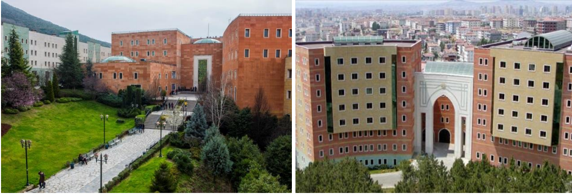
Figure 6. Portals, oriels and domes in Yeditepe University buildings

The structure, which can be described as ‘ eclectic ’, ‘ kitsch ’, and ‘ orientalist ’ with these features, is a good example of the relationship between the management, power, and kitsch with its concept proposed by its founder.