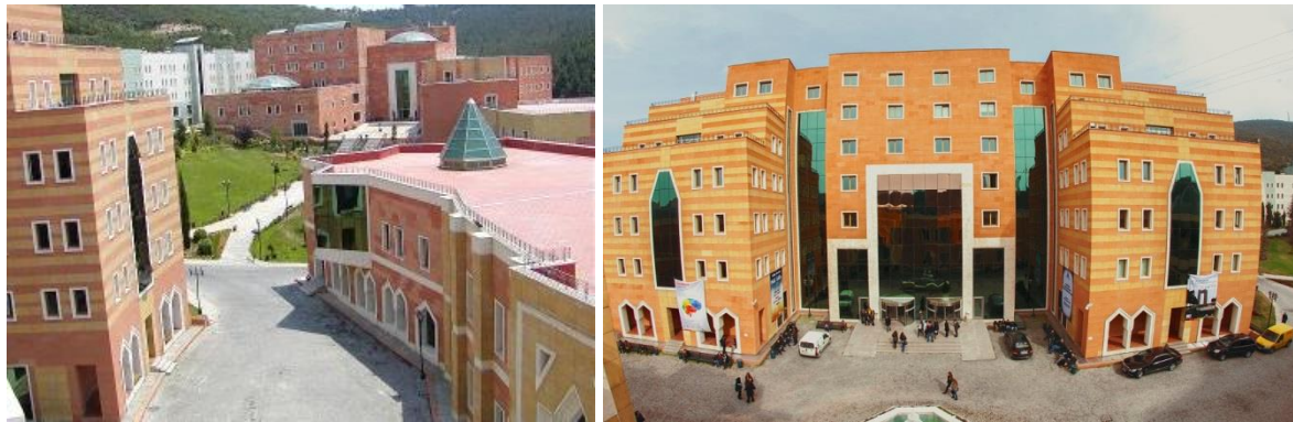
Figure 5. Buildings with portals, cones and riwaqs inspired by the Seljuk period at Yeditepe University

It is entered through gates to the buildings inspired by the iconic portal tradition of the Seljuk architecture reaching 22 meters in height (Figure 5). These forms are detached from time and far from the proportions of the Seljuk period works from which they are gathered.