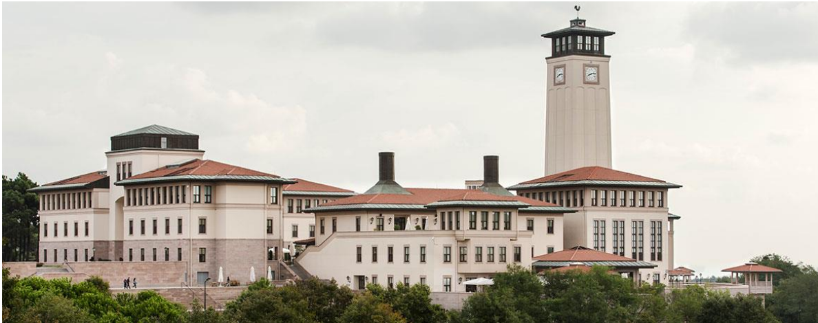
Figure 7. Traditional Turkish House-like building facades in Koç University Rumelifeneri Campus

The Rumelifeneri Campus of Koç University founded in 1993 by the Vehbi Koç Foundation, which was opened in 2000, consists of 60 buildings with faculty buildings, laboratories, library, dormitories, housing, sports, and social facilities in Istanbul Sarıyer on an area of 25 hectares. The complex which emulates the ‘ Traditional Turkish House ’ and the ‘ Second National Architecture ’ movement which is stylized with the characteristics such as wide eaves, moldings, and oriels is the work of the Iranian-American architects Mozhan Khadem living in Boston (Figure 7, 8).