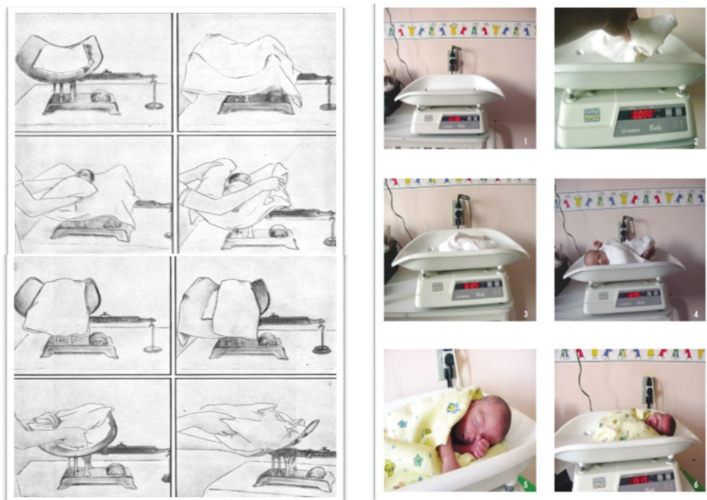
Mosaic-figure 3 - Paired step-by-step images for the newborn weighing procedure. 8,9

Overall, it can be pointed out that in the description of 1949, the technique was demonstrated in eight quadrants, and in 2011 through six. In these, the newborn appears in six (75%) and three quadrants (50%), respectively.