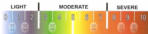
Figure 1 - The intensity of the pain was using the Analog Visual Scale

In the use of the Visual Analogue Scale (E.V.A) there must be the patient's visual contact with the scale and he must be able to point or signal the examiner to what degree his pain is. It can be a numerical ruler with ten centimeters, divided into ten equal spaces, being presented in a simple way, in which the numeration goes from 0 to 10, that is, from 0 to 2 it is characterized by a slight pain, from 3 to 7 presents moderate pain and, finally, from 8 to 10 with a higher score, showing intense pain. 10