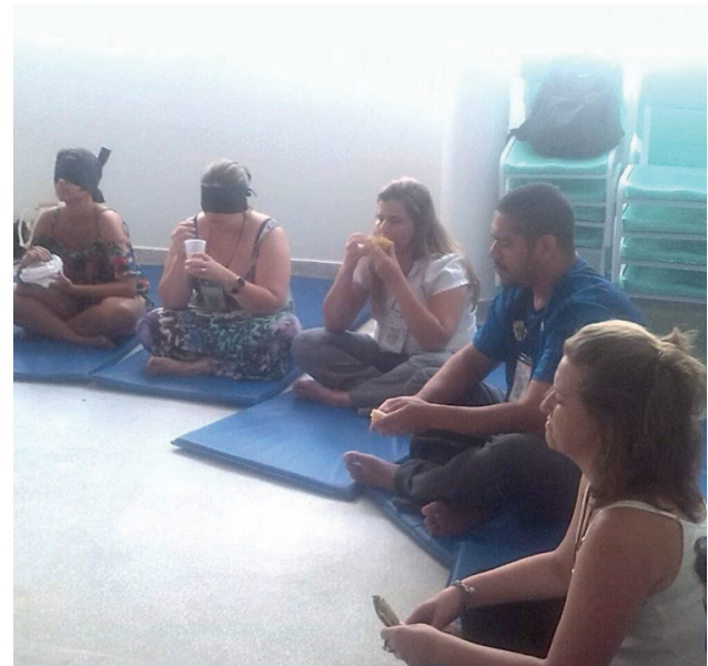
Figure 2 – Technique of the senses, first day.