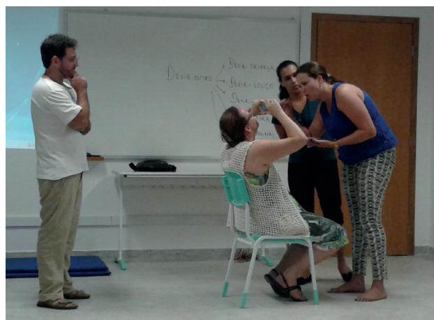
Figure 7 - video-forum, second day.