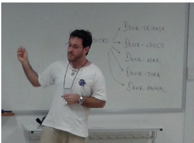
Figure 3 – Audiovisual device, second day.