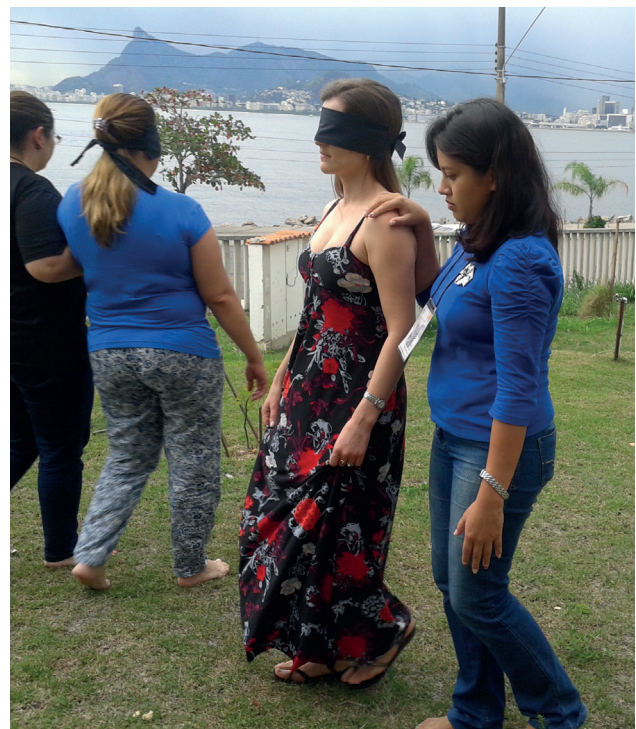
Figure 4: doubles, second day.