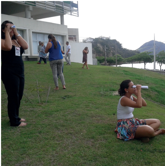
Figure 5 – “straw”, second day.