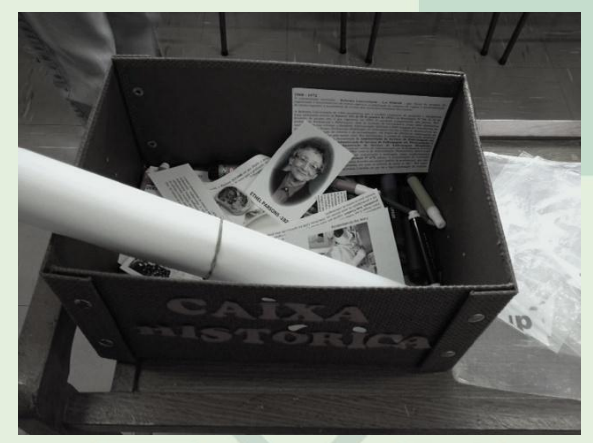
Image I -Historical Box of materials used in the development of the strategy. São Paulo, 2013.