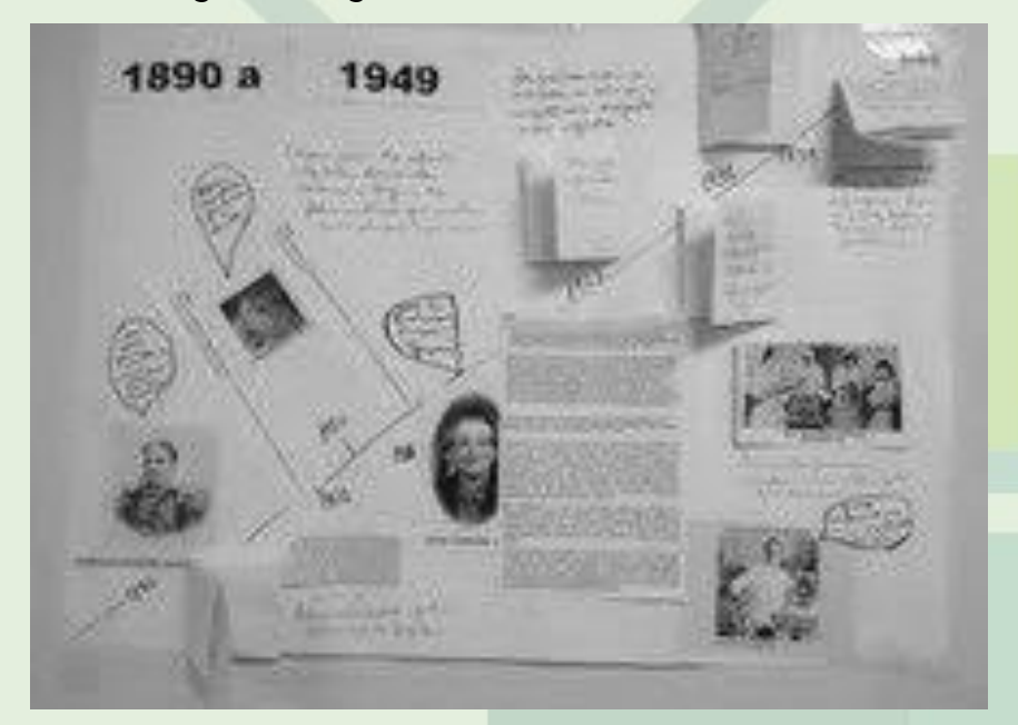
Image IV - Interactive Panel representative of the period of 1890 to 1949-Timeline on the history of education in Nursing Administration. São Paulo, 2013.

Upon completion of the task, participants were encouraged to presentation and discussion of their products. The results were socialized from the creation of frames in the timeline, and there have been significant changes and highlight important historical landmarks of the teaching of nursing administration.