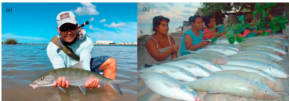
Fig. 2. Variation in value of Polynesian bonefish. (a) A bonefish caught and released by a guided recreational angler, and (b) large adult bonefish for sale in South Tarawa, Republic of Kiribati. Variation in value of bonefish, between the catch-and-release recreational fishing industry and market value in areas absent of recreational fisheries represents a disconnect in transferability of incentives to conserve species and habitats. Local communities can potentially attract greater income while supporting ecosystem-scale conservation by developing recreational fisheries where feasible.

Some conflict is to be expected where recreational fishers compete for fisheries resources with other stakeholders. Financial incentives associated with development of a recreational fishing industry, and cultural links between recreational