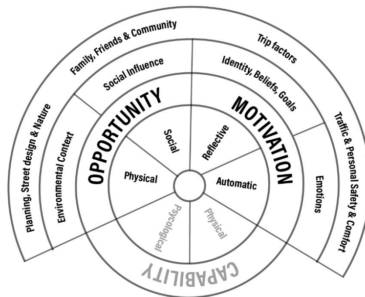
Figure 4. Theoretical domains explored through COM-B (adapted from [55,68]).