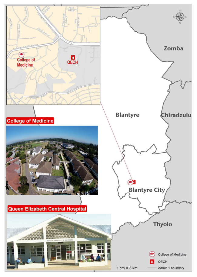
Figure 4 Aerial photograph of the College of Medicine main campus (top) and entrance to the accident and emergency department of the Queen Elizabeth Central Hospital (QECH) (bottom).

neurologists has hugely benefited patient care.<sup>10</sup> The continued need for this collaboration in Malawi has inspired the Blantyre Institute of Neurological Sciences (led by the fourth author) and the Malawi Stroke Unit (led by the third author). The long-term ambition of these initiatives in Malawi, as well as improving health outcomes, is to promote integrated neuroscience training in the country. There are ongoing plans to undertake epilepsy surgery, and the success of this will require neurologists and neurosurgeons to collaborate. A long-term goal is to construct a dedicated building to accommodate the Neurosurgery Unit, the Centre for Mental Health and Neurology Services. In the meantime, Malawi's first stroke unit should open in 2019, and will start to consolidate this important interdisciplinary partnership.