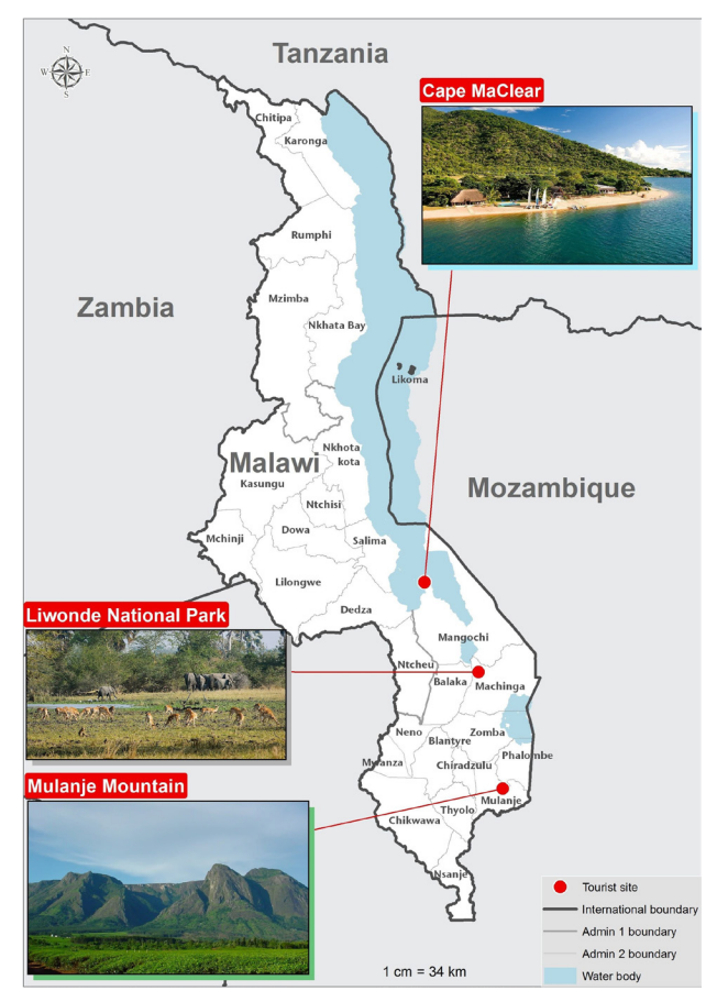
Figure 3 Some of Malawi's tourist destinations: Mulanje Mountain, Cape Maclear and Liwonde National Park.