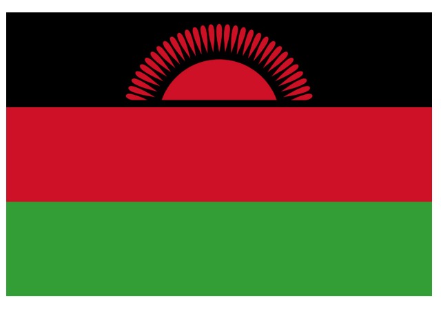
Figure 2 Flag of Malawi (http://flagpedia.net/malawi; accessed on 20 February 2018).

for poststroke follow-up.<sup>8 7 9</sup> Epilepsy also presents a high burden; it is stigmatised and managed by psychiatric nurses. The supply chain of government-commissioned antiepileptic drugs is rarely sustained. These scenarios are far from desirable but highlight the daily barriers faced in managing neurological conditions in this setting.