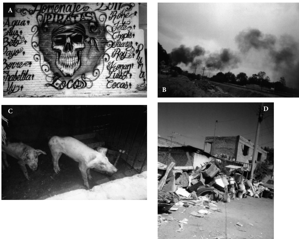
Figure 3. Examples of photographs of risks perceived by the students outside their homes (A) Vandalism in Morales (B) Air pollution due to the operation of brick-kilns in “Las Terceras” (C) Pigs kept by families in “Las Terceras” (D) Waste in the streets of “Las Terceras”.

rance among the residents. One student argued that people should get punished for throwing their waste on the street. Others indicated that people should make a basic contribution by saving water, polluting less and recycling. However, even though most of the respondents expressed that they would like to live in a clean environment, only very few mentioned how this could be achieved. In this sense, a local risk communication program could not only provide information on environmental health risks in the communities, but it could also provide alternatives while actively engaging the population in the process.