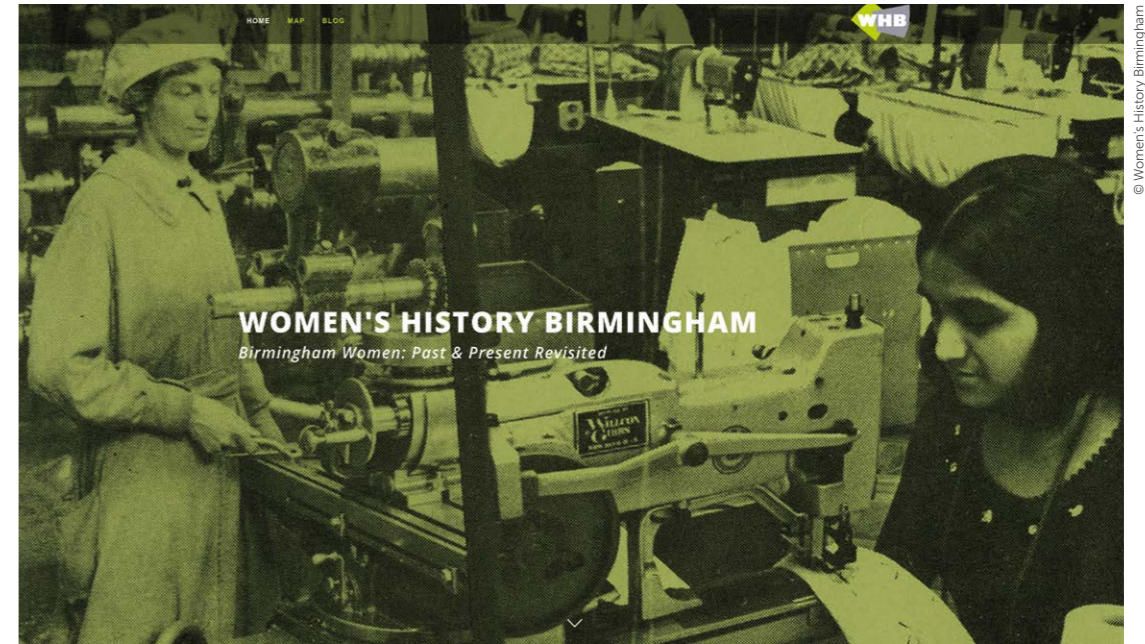
Figure 2 A walk led by Women's History Birmingham inspired by the Feminist Review sponsored walk in the 1980s.