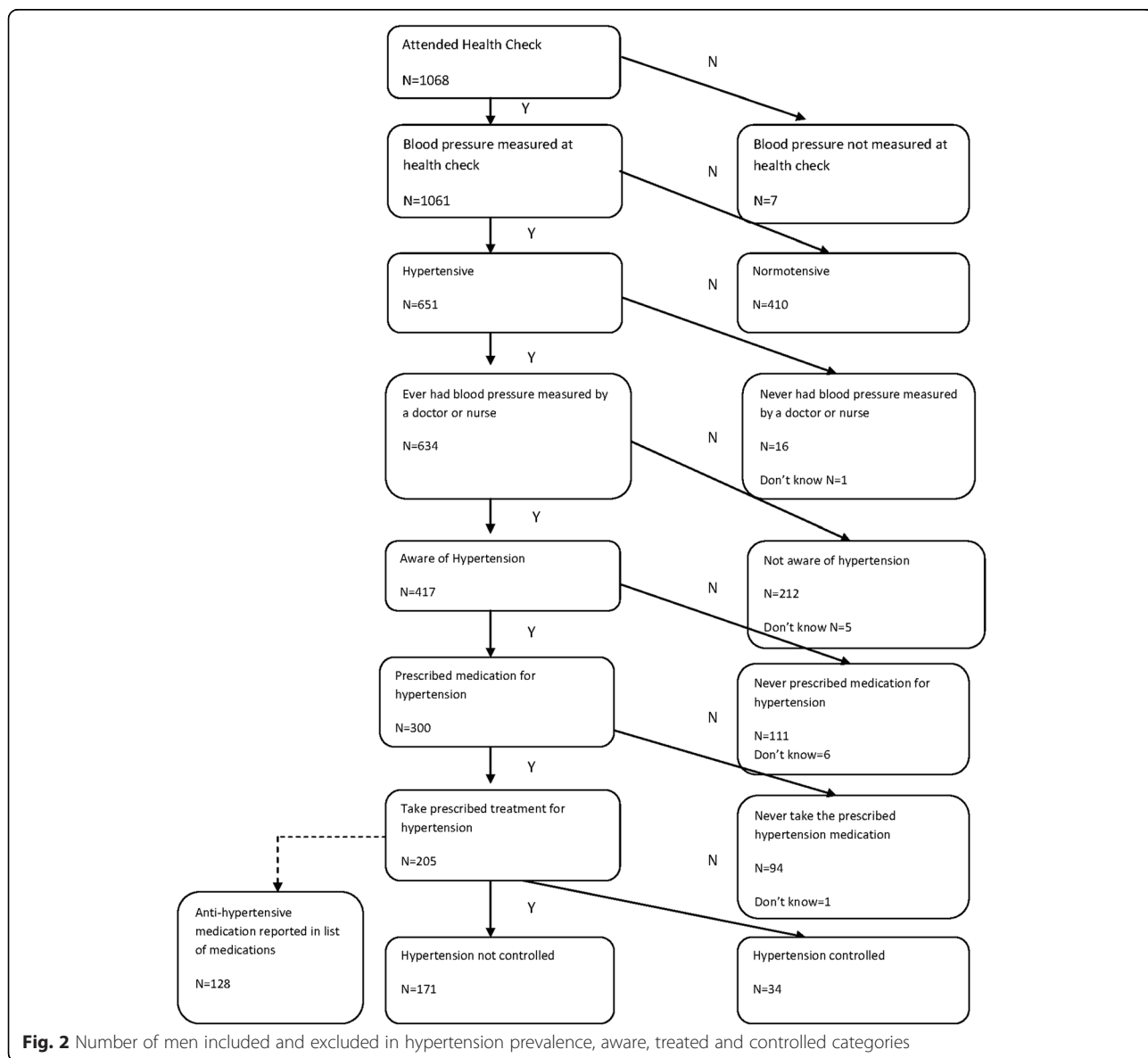
Fig. 2 Number of men included and excluded in hypertension prevalence, aware, treated and controlled categories

A total of 1068 men attended the health check. The mean age was 48.1 years. The age distribution was skewed left, with more men in older age categories. The majority of men did not use medications of any kind (71 %). Most (97 %) reported ever having had their BP measured by a doctor or nurse. There were 669 men (62.6 %) who were current smokers. Mean body mass index was 26.3 (SD 4.4) and mean waist to hip ratio was 0.93 (SD 0.07). The prevalence of abdominal obesity defined as mean waist to hip ratio >0.9 was 64.8 %. Distribution of the sample by hypertension stage according to measured blood pressure (not accounting for use of anti-hypertensive medications) was 334 (31.5 %) of the sample had stage 1 hypertension (SBP 140–159 mm Hg