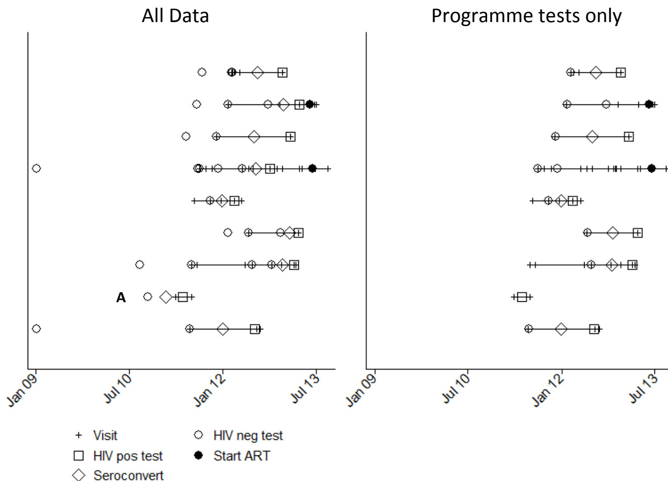
Figure 2: This graph shows the timelines of nine women who first attended the clinics after January 2011. These timelines show HIV tests (negative and positive), visits, dates of starting ART, and approximate sero-conversion dates calculated as the midpoint between a positive test and the last negative test. The lines connect the first and the last visits. The timelines on the left use all HIV test data, while on the right only programme tests are used. As a result, the estimated time of sero-conversion – or the estimation of sero-conversion at all – is often different in the two data handling approaches. In the timeline labelled ‘A’ the sero-conversion date is calculated using a negative test prior to the first visit, which would not be permitted in our primary incidence estimation procedure, and also estimates the sero-conversion date to be prior to the start of follow-up, thus being excluded from all analysis.