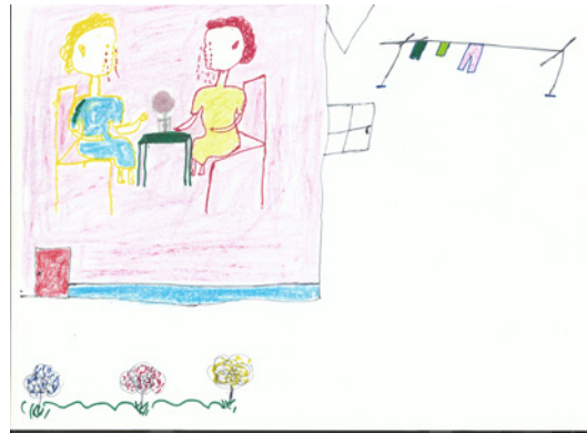
Fig 5. Participant drawing depicting the pain of disclosure.