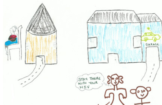
Fig 4. Participant drawing depicting the isolation of HIV stigma.

One story also revealed the violence that a woman encountered when she disclosed to her partner and others described how stigma could lead to secrecy, which can have a negative