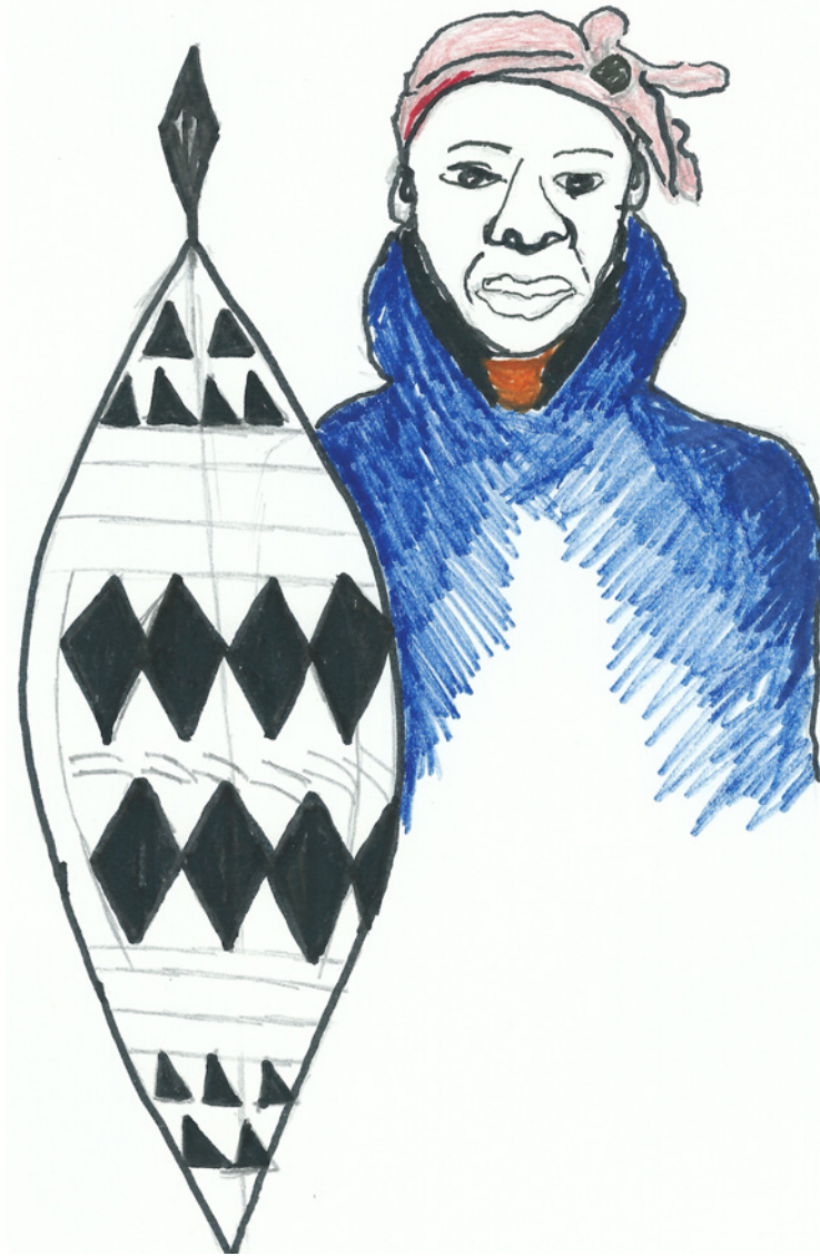
Fig 1. Participant drawing depicting the 'armour' of ART.