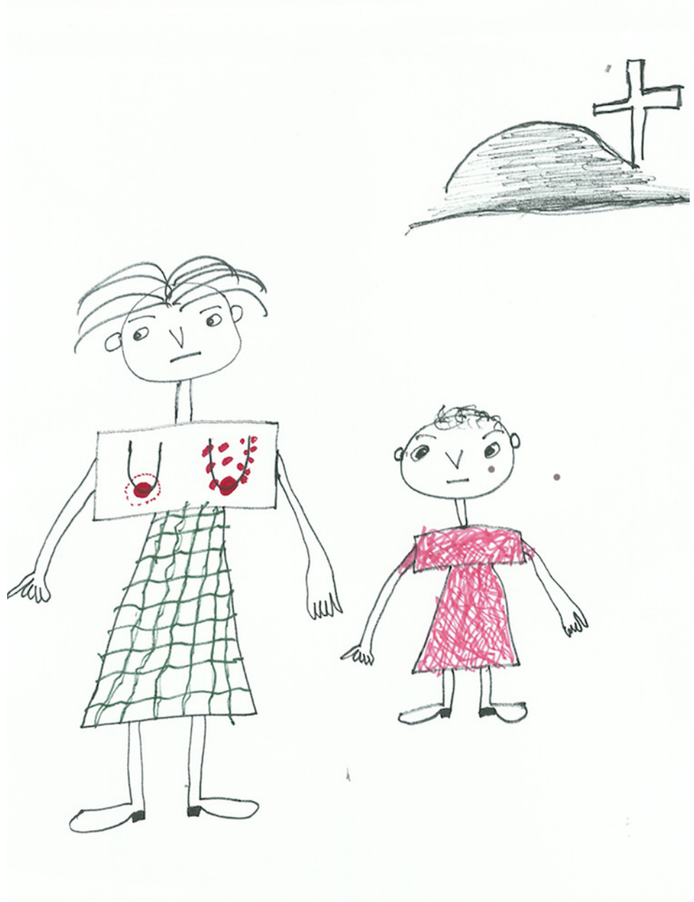
Fig 2. Participant drawing depicting the loss of a child.