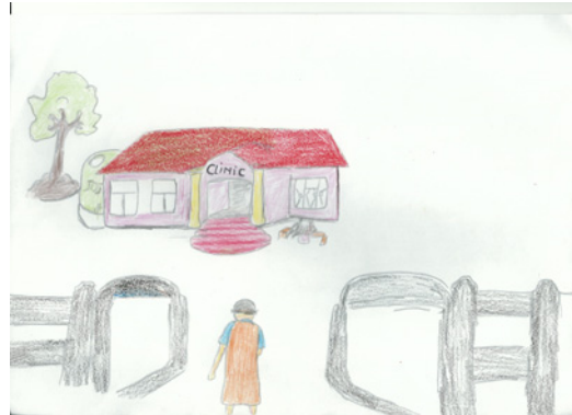
Fig 3. Participant drawing depicting walking to clinic to do an HIV test.