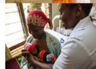
Figure 4 Overcoming socio-cultural barriers to the scale-up of kangaroo mother care and preterm care. Both caregivers and providers may have barriers to the uptake of KMC. Local context must be taken into account to understand and overcome these barriers. Based on literature and programme experience of the authorship team, we summarise some of the common barriers faced and enablers found. KMC: kangaroo mother care.