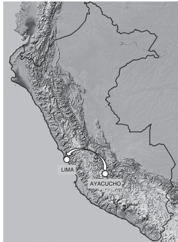
Figure 1 Peru map showing the locations of Secce (Ayacucho) and Lima (modified from reference 11).

Pampas de San Juan de Miraflores was the urban area for the study. It is a typical shanty town where migrants from rural areas have moved into Lima, Peru's capital,