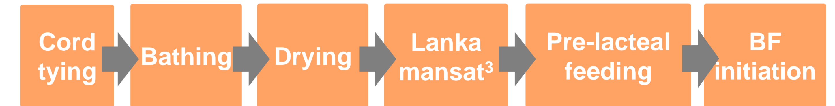
Fig 2: Sequence of newborn care practices following birth

Finding: There are other competing newborn care practices which have more cultural values to mothers