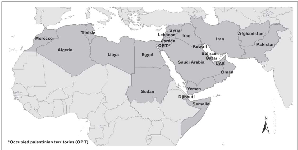
FIGURE 1. Map of the MENA region including the countries that are covered in this review. MENA, Middle East and North Africa. Reproduced with permission from [2].

The most distinctive feature of the epidemic in MENA that manifested itself in the new data is the rising HIV epidemics among key populations including people who inject drugs (PWID), men who have sex with men (MSM), and to a lesser extent female sex workers (FSWs) [8*,9*,10]. The majority of the epidemics appears to be relatively recent with emergence within the last decade. Most epidemics appear to be growing with a trend of increasing HIV prevalence in multiple countries. Table 1 displays HIV prevalence among key populations per the most recent available IBBSS studies;