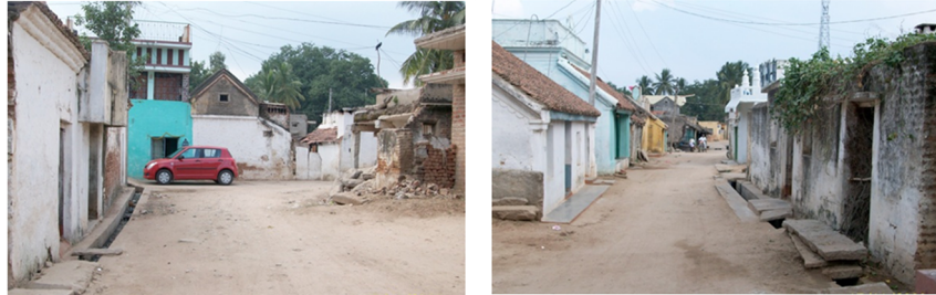
Figure 3. Examples of low-scoring communities. These are pictures of 2 low scoring communities overall. You can see in communities from urban Canada and rural India there is partial or no sidewalks, not many crosswalks, not many planted trees or aesthetically pleasing features. In addition the buildings are not well maintained. doi:10.1371/journal.pone.0110042.g003

overall appeal measures also need to be examined in analyses of predictive validity. Our analyses here did find that some variables requiring the observer to express an opinion had high reliability. However in the case of judgments about suitability for biking there were specific inter-observer differences reflecting their own experiences. Our findings with respect to the three items with low ICCs described at the end of the results, has led us to remove the first and third of these and to clarify the definition for the second.