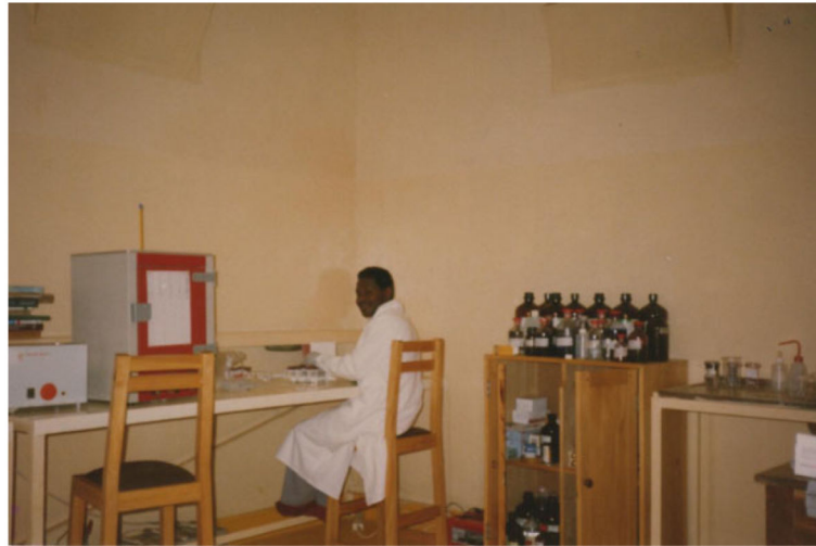
Figure 1. The laboratory at Kyamulibwa field station in 1990.