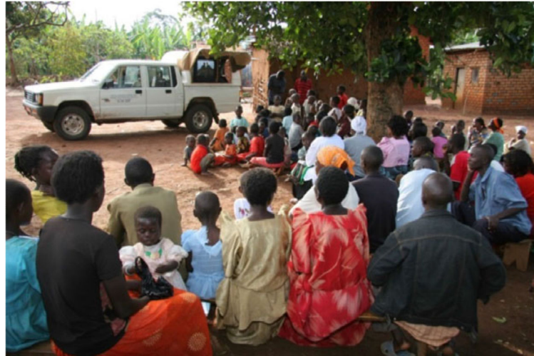
Figure 2. Community meeting in Kyamulibwa, Masaka District, 2009.