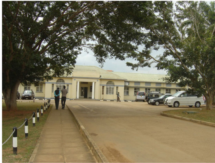
Figure 3. Uganda Virus Research Institute.