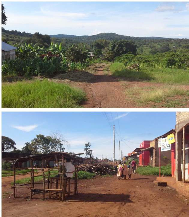
Figure 2. The main road in study villages in the lowest and highest urbanicity quartiles, Kyamulibwa, Uganda, 2011. (A) Village in the lowest urbanicity quartile; (B) village in the highest urbanicity quartile.

As the aim of our study was to investigate whether increasing levels of urbanicity in rural settings were associated with an increase in unhealthy lifestyle factors, urbanicity was divided into quartiles. Each quartile was coded as its respective midpoint value since urbanicity scores across the 25 villages were not normally distributed. Analyses were restricted to individuals with data on age, sex, SES, and at least one lifestyle risk factor. Prevalence was calculated for each binary outcome (lifestyle risk factor), stratified