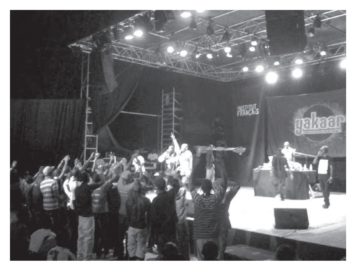
Figure 34.1 June 2013 – Pre-show of Yakaar Festival of Urban Music, with Keur Gui and NitDoff Killah (Location: French Institute in Dakar, at Dakar-Plateau)

This critical mix is illustrated below in an extract from Senegalese Matador's track 'Hip Hop Attitude', which highlights how such a 'hip hop writing of the voice' goes 'beyond simply writing and reciting', but is about 'setting down' oneself on the beat ; it stands in one's 'veins', as a 'way of living', 'self-made in the streets', in which a 'resourceful spirit' is about 'working hard' and 'serving others before oneself'.